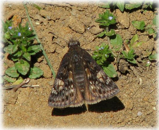
Juvenal's Duskwing utilizes red oak by Kerry Wixted

Northern red oak is a popular tree for many landscapes, but it is important to give it room to grow. One issue to note: red oaks are susceptible to oak wilt. Oak wilt kills young and mature oak trees. The early symptoms often include leaves that turn dull green or bronze or appear water-soaked. Eventually, the leaves wilt, turn yellow or brown and drop off the tree in May and June. At this time, oak wilt has been found in a localized area of western Maryland.