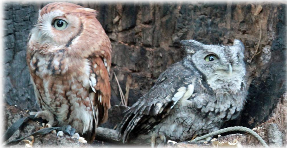
Red and gray morphs

Eastern screech owls can be found throughout the eastern United States and parts of northern Mexico year round. They also are common throughout Maryland and can often be found in and around backyard habitats.