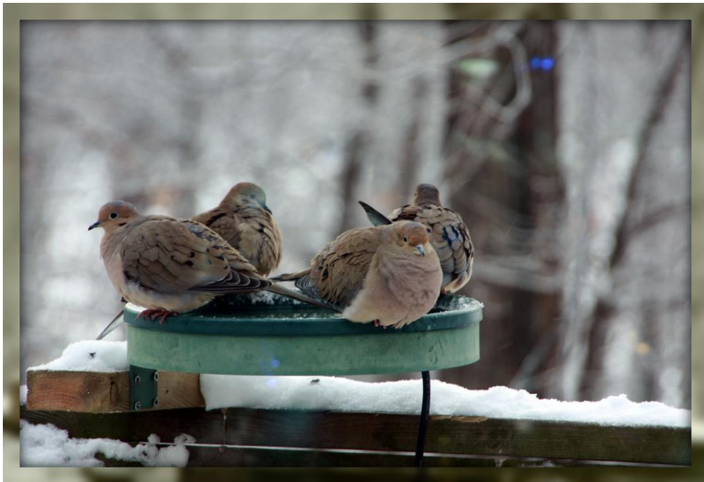
Mourning doves enjoying a heated bird bath

Finally, don't forget to add a winter water source! Learn more about winter water sources here .