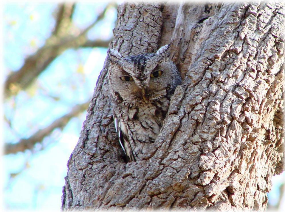
Screech owl in a cavity by Zach from Gamboa, Panama - Screech Owl 02, CC BY-SA 2.0

Eastern screech owls make 2 distinct calls- a loud, descending whinny or an even-pitched trill. Both sexes will make calls. The whinny is usually used to defend territories while the trill is used by pairs or families. Mated pairs may sing to each other both during the day and at night.