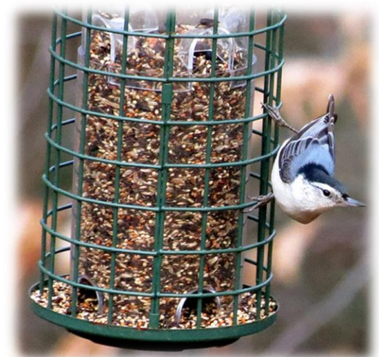
White-breasted nuthatch at a tube feeder by Kerry Wixted