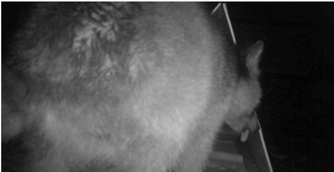
This camera was placed too close to a bait plate used for a mammal study. The results included lots of raccoon back ends!

Once you have selected the perfect camera for you, the next step is to place it out in your backyard. Pay attention to areas where you have noticed scat (poop), tracks, or other wildlife sign. Cameras ideally should be placed off the ground, mounted to a pole or tree. Cameras also can be mounted to bird feeders, but be aware of focal lengths before mounting as some cameras cannot take good, up close photos. Always make sure you have permission from landowners or land managers before placing trail cameras out and consider using security locks for your camera and SD card. Try taking a couple of test shots to make sure your camera is angled in the right direction.