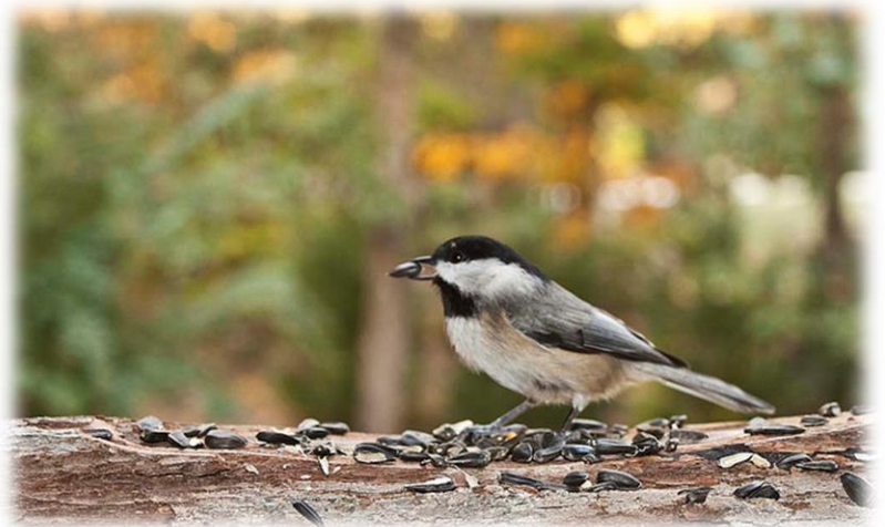
Chickadee enjoying sunflower seeds

Best way to offer: Hopper feeder, tube feeder, or platform feeder