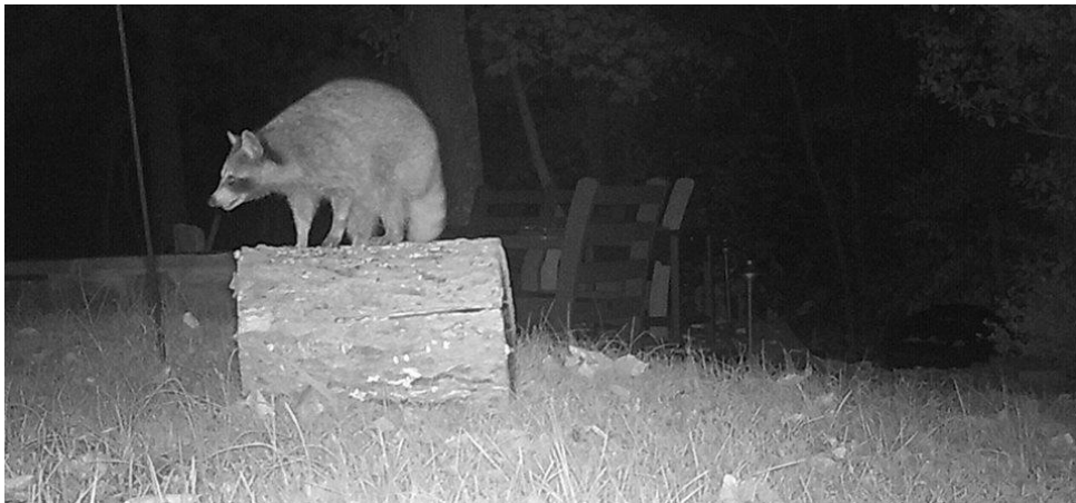
This camera was placed under a bird feeder and caught a local raccoon cleaning up the leftovers. This photo was taken with a low-glow flash camera.

Night time is usually the best time to catch backyard mammals in action. Therefore, it is important to look into trail camera flashes before purchasing. While traditional white flash allows for color photos at night, it also has a tendency to scare or disturb the animals you are hoping to capture on camera. Cameras can also have low-glow flash options which emit a visible flash that is significantly reduced. The images will be taken as black and white photos, but it lessens the disturbance created by the flash. The final option includes no-glow flash cameras that have black LEDs which emit no light during picture capture. These photos will also be black and white. It is important to note that the number of LEDs correlates to flash range, so a higher LED count often equates to a higher distance flash range.