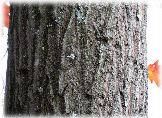
Northern red oak in fall (left) and bark (right)