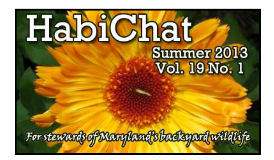
HABITAT - the arrangement of food, water, cover, and space - IS THE KEY.