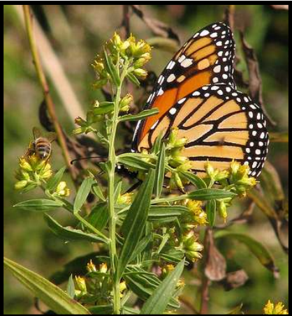
Monarch on goldenrod

Coreopsis ( Coreopsis spp.)- Coreopsis are prairie plants with a daisy-like appearance. They often come in hues of yellow, red and orange and are usually annual in nature. Like blazing stars, coreopsis are hardy, drought-tolerant plants. They often attract butterflies while in bloom, and later go to seed just in time for hungry migrants to indulge upon.