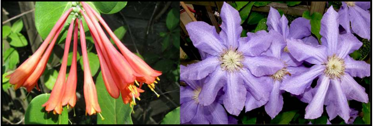
Trumpet honeysuckle (left) and clematis (right) are easy to grow vines that work well in containers