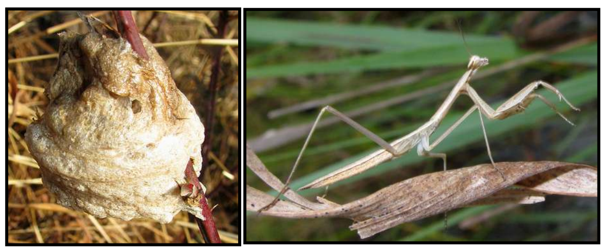
An egg case from a European mantis (left) and a young mantid (right) by Kerry Wixted

While females are notorious for consuming the males, only 30% of males lose their heads after (or during) mating. In the fall, females lay 100-400 eggs in foamy egg cases known as oothecas which later harden into a more papery texture. These oothecas can be found attached to branches, houses and grasses in the backyard. In May, young mantids break out of the egg casing and will begin hunting prey (which sometimes includes their slower siblings!). The tiny mantids will go through several molts until reaching their adult stage. Overall, most praying mantises live from 6 months to a year.