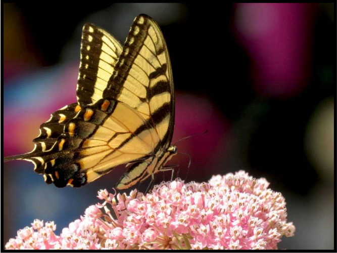
A tiger swallowtail dines on swamp milkweed

If there is a particular topic that you would like to see on our site, then please don't hesitate to contact me to let me know! My information can be found at the bottom of this newsletter. Happy Habitats!