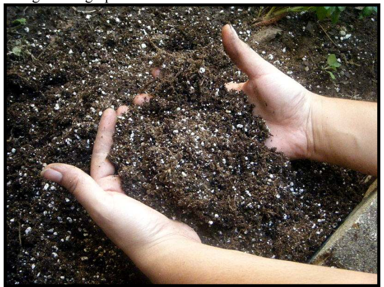
Quality potting soil with perlite (white spots)

about soil. Most potting soil has components like sphagnum peat moss, vermiculite and/or perlite. A quality potting soil has 10-15% perlite. Perlite helps separates peat moss fibers, so the soil is more porous. Vermiculite works in a similar manner, but it tends to hold more moisture. If staring seeds, then a vermiculite-based potting soil is ideal. For most plants, an all purpose potting mix will suffice. However, some potting soils are designed for acid-loving plants or for cacti and succulent species. Additional container gardening tips can be found below: