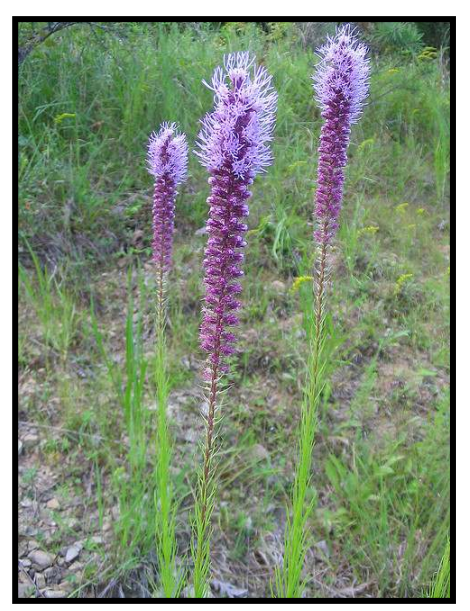
Blazing stars in western MD

Blazing stars typically grow best in sunny areas that have dry soil. Normally, plants can grow 2-4 feet in height, but some can reach heights up to 6 feet! Most blazing stars bloom in late summer, from early July through September. They produce tall spikes of purple flowers. Each flower spike contains multiple flowers which bloom from top to bottom. Some species, like the scaly blazing star ( Liatris squarrosa ) produce globular flower heads while most others have cylindrical spikes of flowers. The showy flowers are extremely attractive to pollinators including bees, butterflies and the occasional