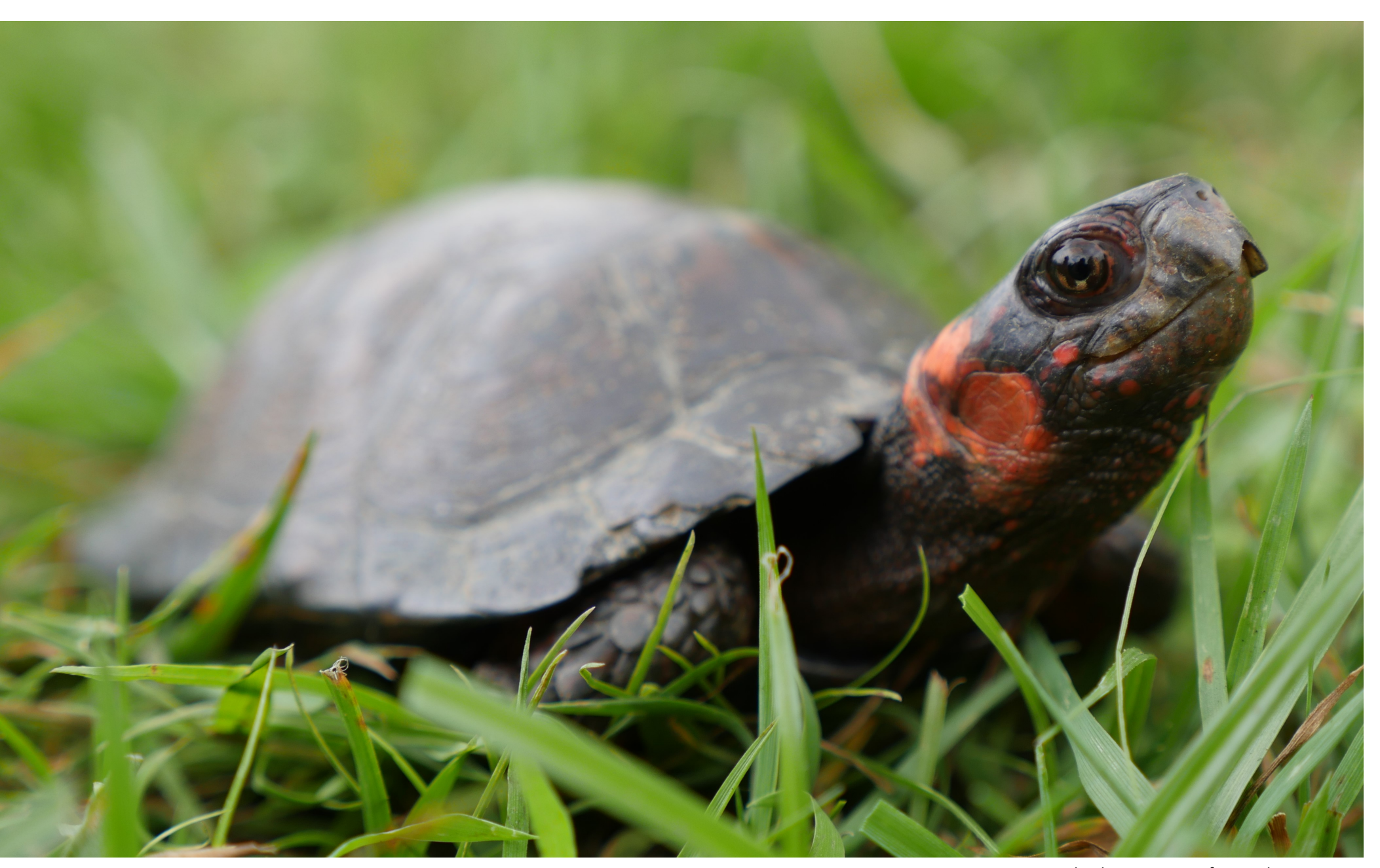
Maryland Department of Natural Resources