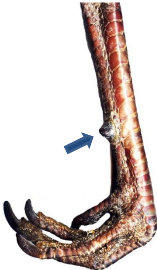
Jakes (Juvenile Males)