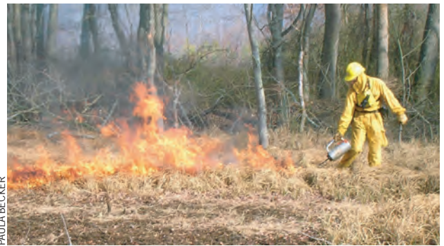
An ecologist sets and carefully monitors a prescribed burn to keep shrubs and trees from crowding out rare sun-loving plants.

Fire was once a major force in the coastal areas of Maryland as well as an essential component needed for Carolina Bays. Without fire disturbance, bays eventually become filled with woody shrubs and ultimately trees. Closed tree canopies later shade out sun-loving plant species found within these ecosystems, many of which are rare. In the future, prescribed burns may be used by Department of Natural Resources ecologists to keep the Carolina Bays free of shrubs and trees and allow the rare plants to survive.