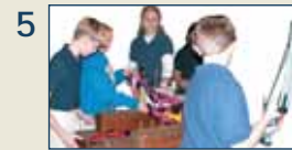
5 When each archer has shot their arrows and the range is clear, three whistles allow the archers to set their equipment aside.