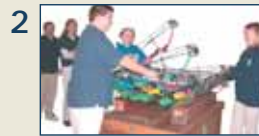
2 Proceed upon hearing two whistles to the shooting line.