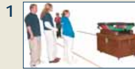
1 Start at the waiting line.