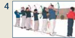
4 Each step of the shooting sequence is triggered by a command from the instructor.