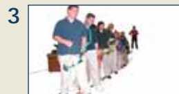
3 One whistle is blown to indicate that shooting can begin in a sequence of steps.