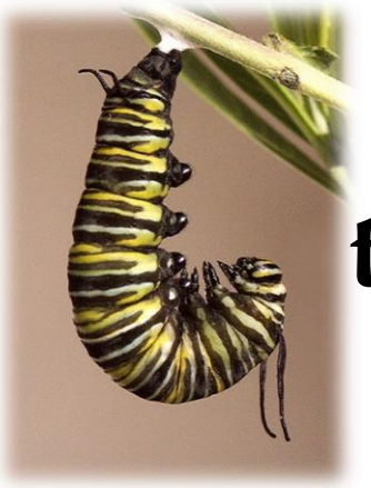
Sid Mosdell CC BY 2.0