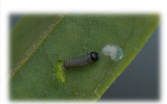
Smalljude CC BY 2.0