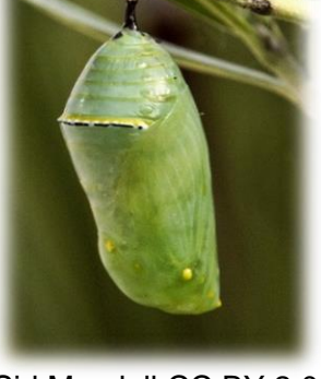
Sid Mosdell CC BY 2.0