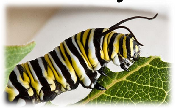
Eric Heupel CC BY-NC 2.0

Time to eat AGAIN! Rub your tummy 20 times & say YUM.