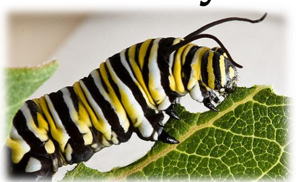
Eric Heupel CC BY-NC 2.0