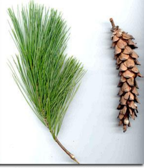
White pine (Pinus strobus) by Kerry Wixted

To start out, find a long piece of cardboard to use for a conifer quest board. Take a marker and write 'Conifer Quest' at the top of the board. Punch two holes, a quarter inch apart every six inches down the center of the board. Put twist ties through the holes. Next, go exploring! When a conifer is found, take a small sprig and attach it to the board using the twist ties. Be sure to only grab small amounts of the tree and make sure to have permission to take parts of trees on other people's property. Feel free to attach any cones that might be found as well. Try to identify the trees using a book like Peterson's First Guide to Trees or by using a key online. Write the name of the tree under each sprig as well as a description of the tree such as what the needles look like and anything unique about the tree.