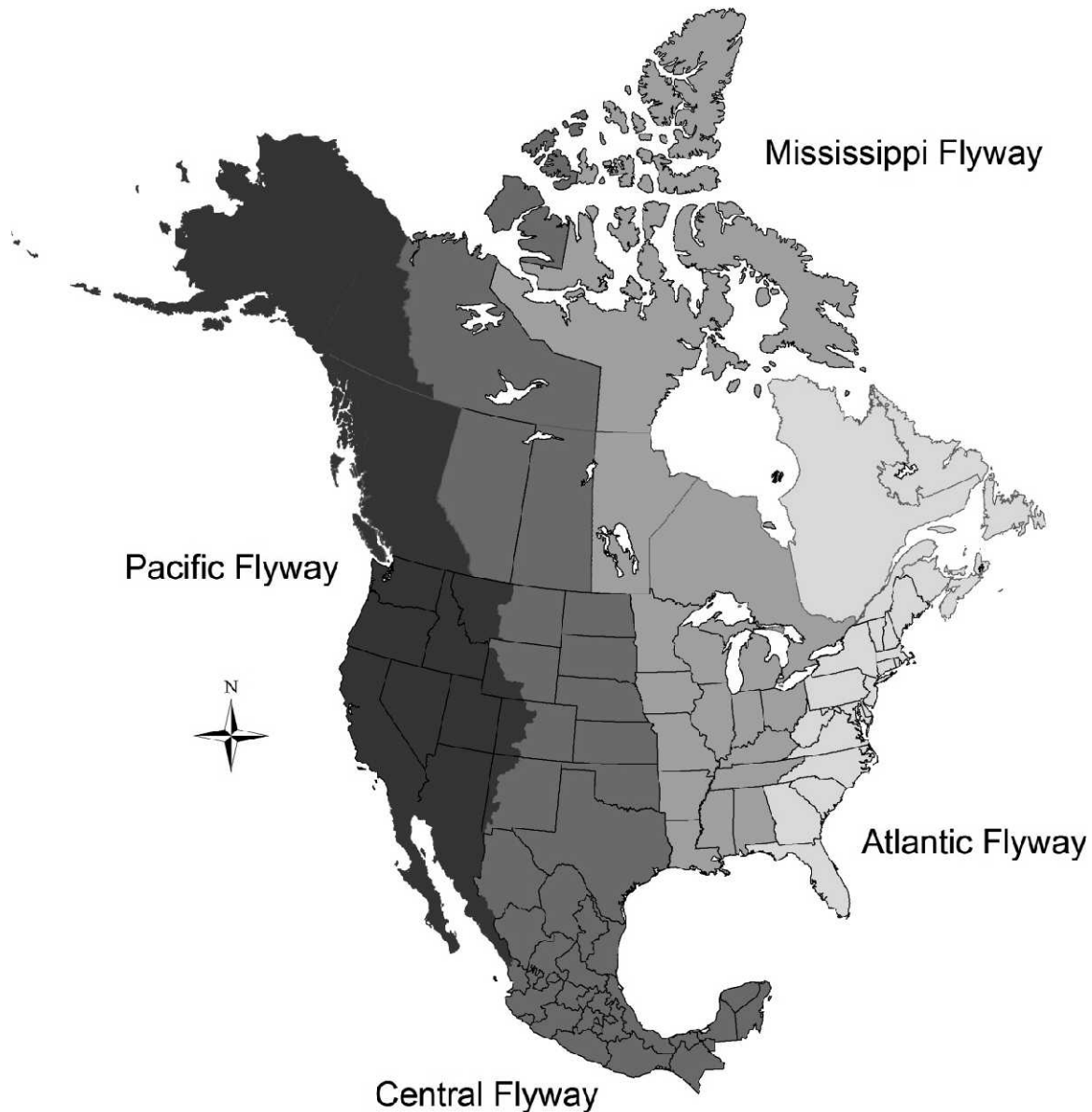
Figure 1. North America's four waterfowl flyways.

Canada (Figure 2): the North Atlantic Population (NAP), the Southern James Bay Population (SJB), and the Atlantic Population (AP). The flyway's temperate-breeding geese (Atlantic Flyway Resident Population [AFRP]) nest in all 17 states and southern portions (<math><48^{\circ}\text{N}</math>) of the Canadian provinces (Figure 2).