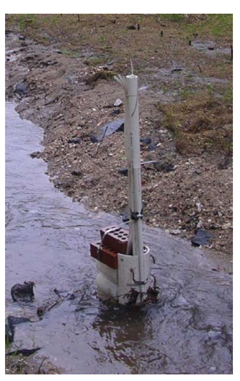
Figure 3-2. Siphon sampler

Upon return from the field, siphon samplers should be well-cleaned and inspected for damage, so that any issues can be addressed immediately so that the samplers will be ready for redeployment for the next round of sampling. The siphon samplers collect a lot of debris and sediment and sometimes are toppled and buried during very high flow events. The best way to clean the sampler is to first remove gross silt accumulation using a garden hose. Wash any dirt