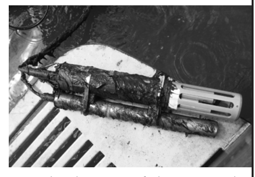
YSI sonde with copper anti-fouling sensors and sonde guard deployed for more than 1 month during the summer in Puget Sound.

The company reduced maintenance costs by 50% or better when using the anti-fouling kits. The team now visits each field site once per month.