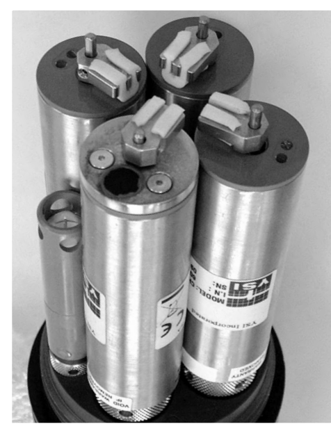
YSI sonde equipped with copper-alloy antifouling kit was deployed in the Arabian Gulf for 3 months. Copper has chemical properties that deter biofouling from adhering and growing on the sonde's surfaces.