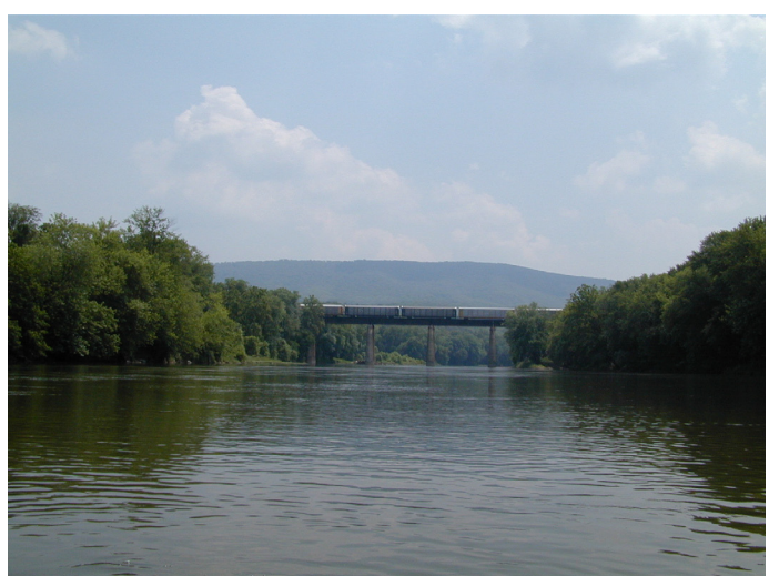
Photo from an EPA NRSA site on Fifteen Mile Creek, western Maryland