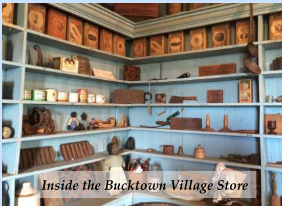
Inside the Bucktown Village Store

Named Araminta, or "Minty," by her parents Ben and Rit Ross, Tubman was the fifth of nine children. Daily survival remained her biggest challenge; frequent separations forced upon her family, in service to their white enslavers, were compounded by the sale of three sisters to distant plantations in the Deep South. Taken from her mother and hired out to cruel masters at the age of six, she was often physically and mentally abused and neglected. She was nearly killed at the Bucktown Village Store by a blow to her head from an iron weight thrown by an angry overseer. She suffered debilitating seizures from the injury for the rest of her life. Such injustices and mistreatment tested Tubman's profound faith. "Slavery," she said, "is the next thing to hell."