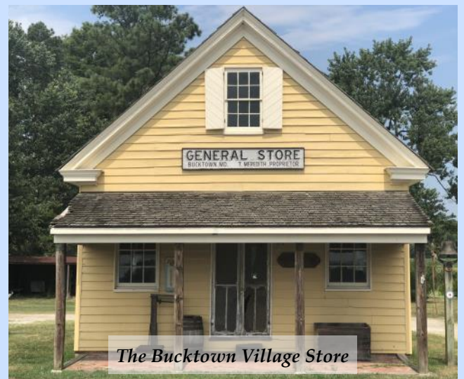
The Bucktown Village Store