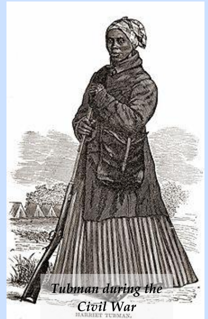
Tubman during the Civil War HARRIET TUBMAN