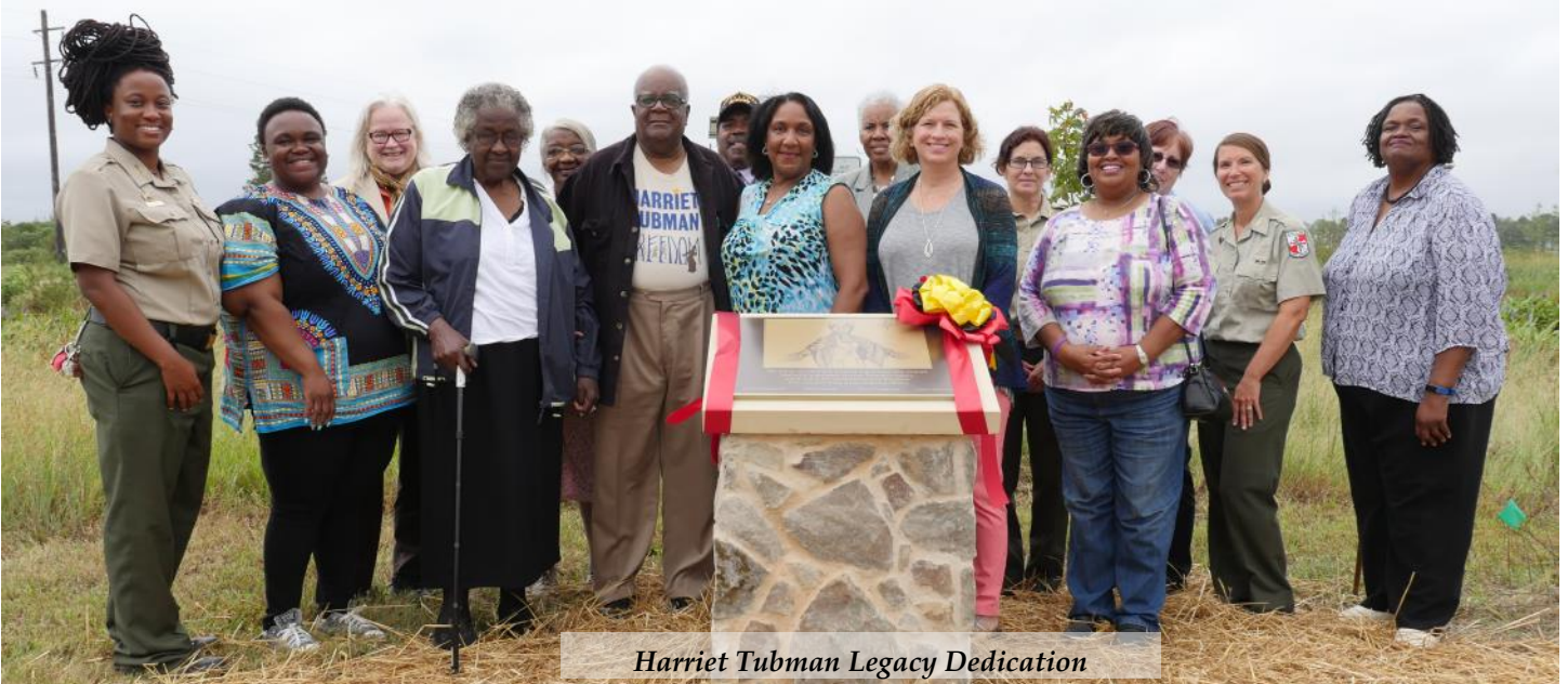
Harriet Tubman Legacy Dedication