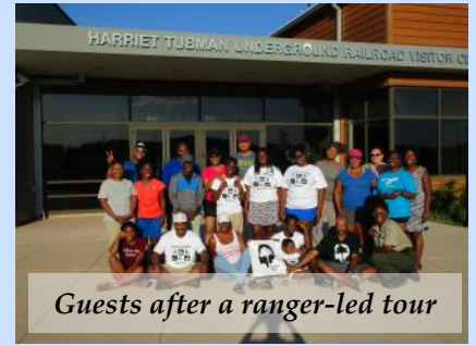
Guests after a ranger-led tour

We are pleased to offer interpretive programs by request and events throughout the year. All of our programs share the message of appreciation of our natural, cultural, historical and recreational resources as a service to our community. So that we may better serve you, we ask that you send a request to us by email htursp.dnr@maryland.gov to get started.