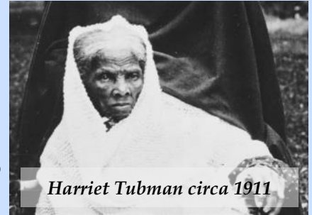
Harriet Tubman circa 1911