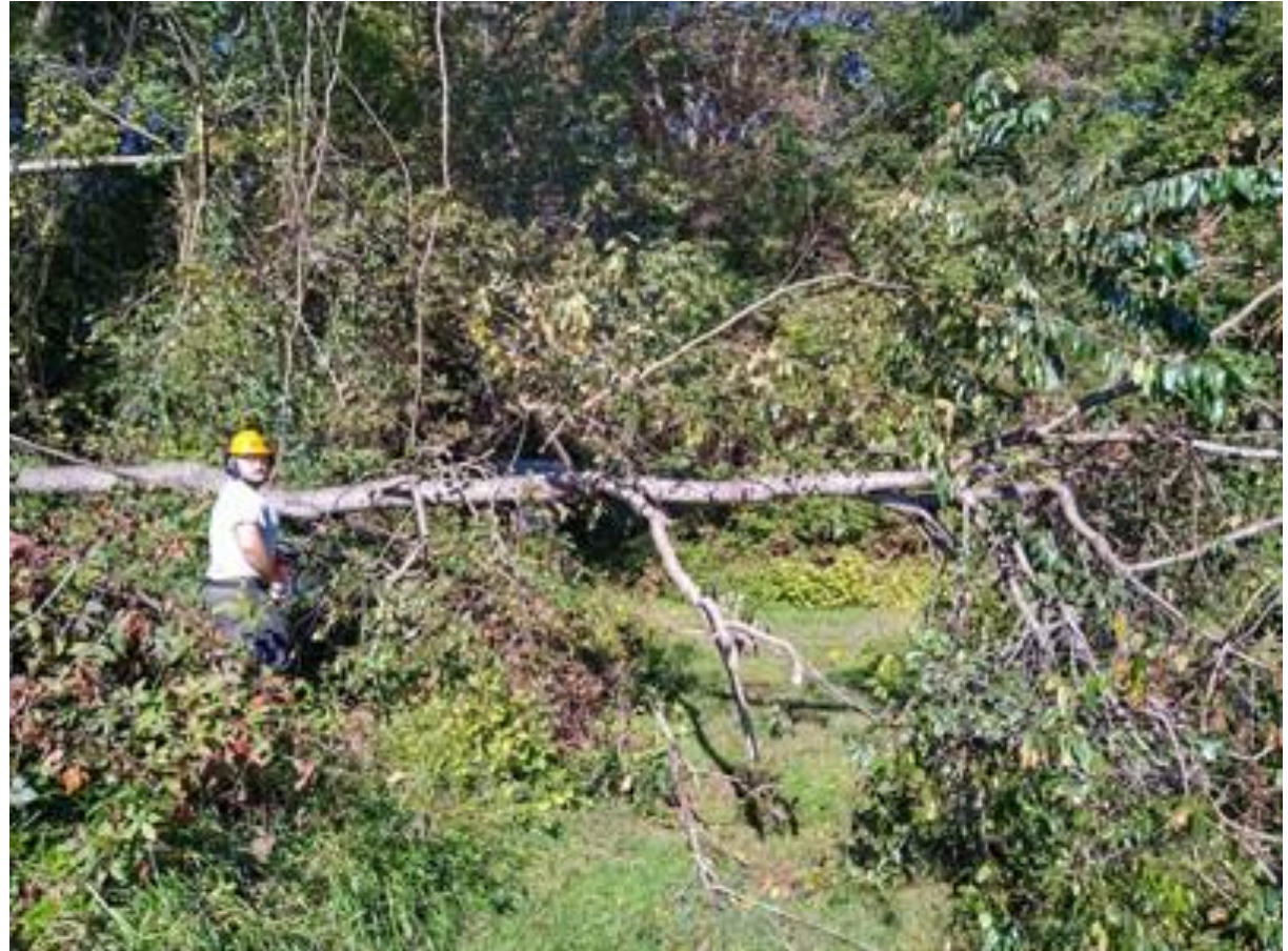
Project Lead Ulery bucking up a fallen tree that dropped across a trail at Merkle Wildlife Sanctuary.