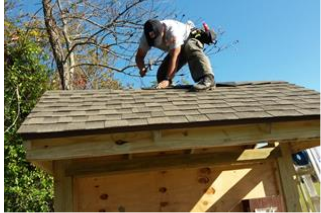
Project Lead Ogburn applying the final roof caps on a bulletin board the MVCC built at Nottingham Natural Resource Management Area.