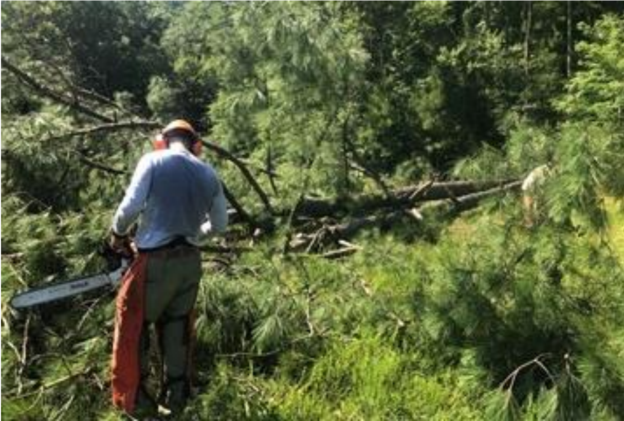
Project Specialist Kozak bucking up a felled tree in support of a major clearing operation at St. Mary's State Park's dam spillway to allow better water flow in the event of a flood.