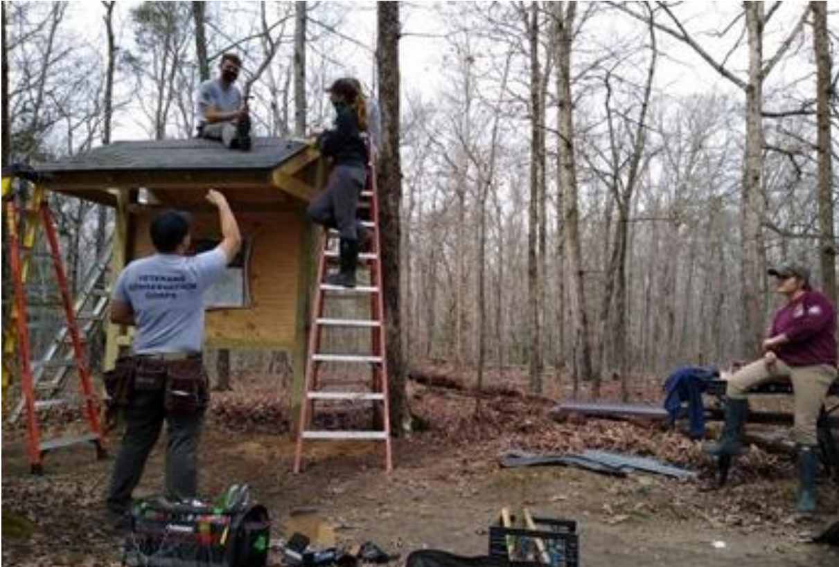
The MVCC leading a training session to Gunpowder's Maryland Conservation Corps at Cedarville State Forest on how to build a bulletin board.