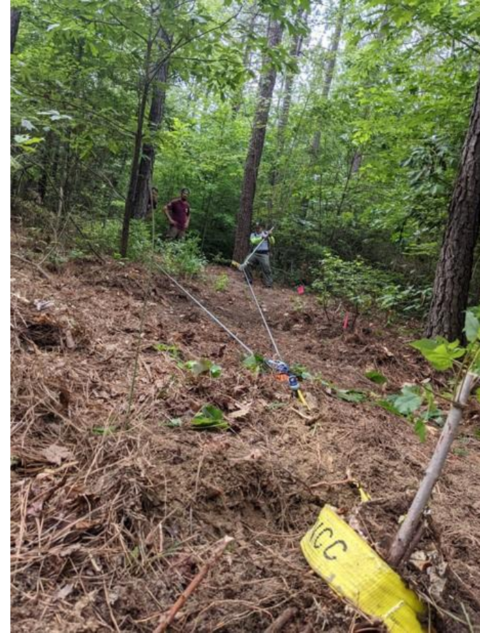
The MVCC demonstrating the correct usage of the griphoist device at Cedarville State Forest.