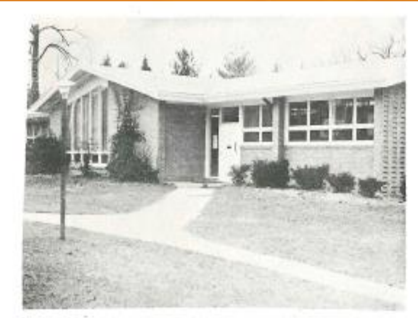
Gaithersburg branch of the Montgomery County Public Library on Brookes Avenue