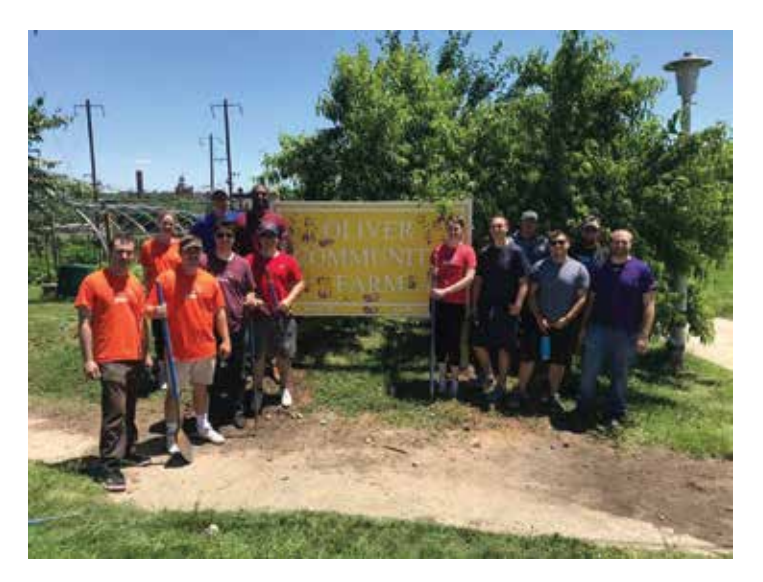
Volunteers of The 6th Branch brought this community garden to life in 2017.

children can socialize and exercise after school, and still others are converted into community gardens that provide nutritious food and educational opportunities to the neighborhood.