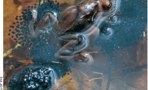
A pair of wood frogs with eggs in a vernal pool. A close look reveals the smaller, darker male sitting on the female's back.