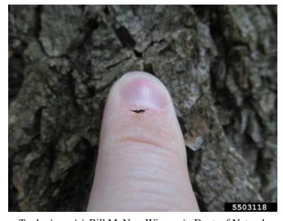
T. planipennisi.