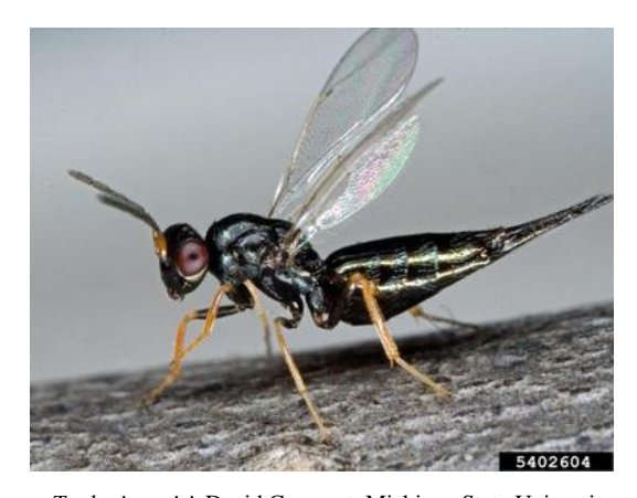
{\it T. planipennisi.}

While most trees can tolerate low to moderate levels of boring insects, the density of EAB infestations overwhelms our ash trees. Biocontrols have the potential to reduce EAB populations and allow ash trees to survive. This will reduce the need to treat or remove our trees over time, and protect the ecological benefits that our ash trees provide.