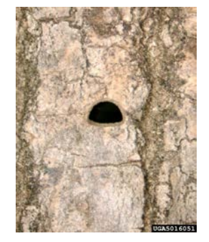
D-shaped exit holes