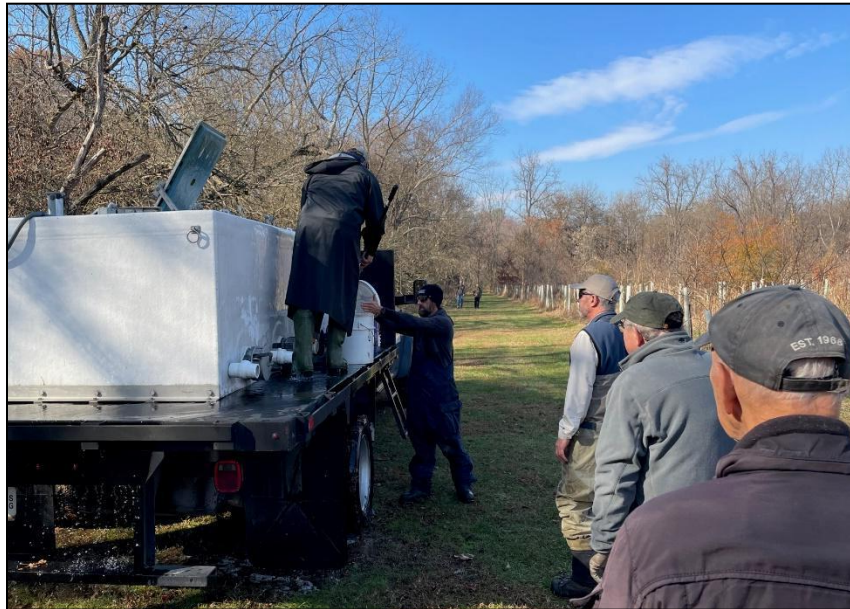
Members from the Potomac Valley Fly Fishers helping stock Catoctin Creek

Trout - Assisted members of Potomac Valley Fly Fishers (PVFF) with trout stocking at the Catoctin Creek Nature Center in Frederick County. PVFF has helped rear hatchery rainbow trout at their small spring fed holding facility in Frederick for the past several years. Members feed and care for the fish through the summer. Club members stocked roughly 300 rainbow trout in the delayed harvest section of the stream.