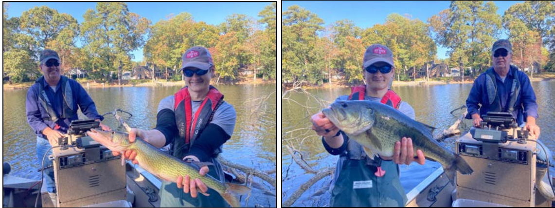
L to R - Chain pickerel; largemouth bass

Eastern Region Impoundment Surveys - Completed the last of fall impoundment surveys to assess black bass populations. Leonard's Mill Pond in Wicomico County was the final survey to be completed. A springtime fish kill of resident gizzard shad was a concern of anglers and pond side residents. The survey showed that the largemouth bass population is robust and healthy, as are various sunfish species. There are still gizzard shad present in the lake; it appears there were no negative effects from the fish kill. The survey also yielded several large chain pickerel, which any angler would love to tangle with. Special thanks to the shad and herring project personnel who assisted us with the survey.