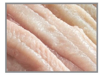
Chesapeake Bay Blue Catfish Fillets