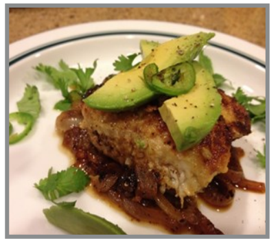
Greens on blues, a Latin-inspired Dish with Chesapeake Bay Blue Catfish