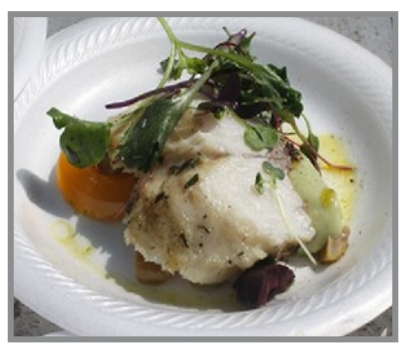
Delicious Chesapeake Bay Blue Catfish

Blue Catfish on campus and includes it in menus and promotions. An estimated 7,265 pounds of blue catfish were served on campus during the fall 2019 semester.