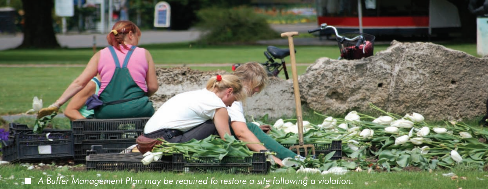
■ A Buffer Management Plan may be required to restore a site following a violation.