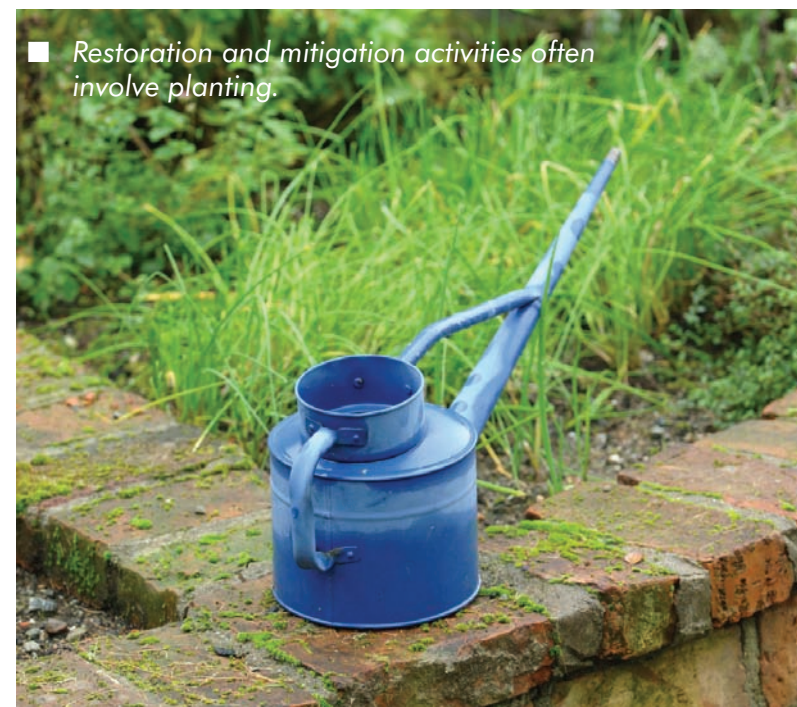
■ Restoration and mitigation activities often involve planting.

they generally do not fully restore or compensate for the ecosystem functions lost as a result of the violation. That is why cutting trees, removing natural vegetation, grading, or filling within the Buffer are such serious offenses, and that is why these activities are generally prohibited unless they are associated with the construction of a water-dependent facility or a shore erosion control measure. For violations involving disturbance to the Buffer, a landowner may be required to develop a Buffer Management Plan, which must include a landscape plan indicating the establishment of the Buffer in natural vegetation (using native species) and maintenance provisions to ensure that the Buffer will be maintained as natural riparian habitat. Through the implementation of the Plan and careful maintenance, it is possible that the functions of the Buffer can eventually be restored.