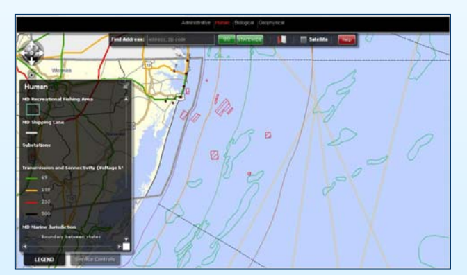
Screen shot of the Coastal Atlas displaying human use data including recreational fishing areas, artificial reefs and shipping lanes