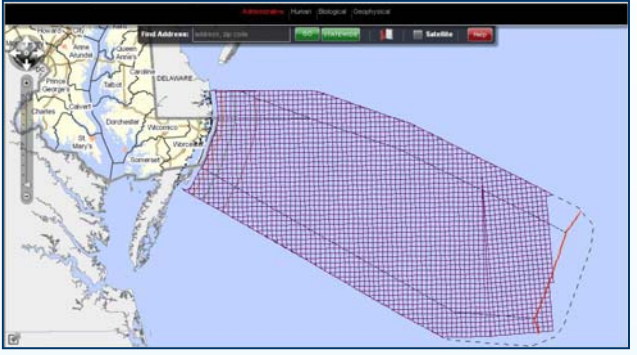
Screen shot of the Coastal Atlas online mapping application. The screen is displaying the ocean area from Maryland's ocean waters out to 200 nautical miles as well as jurisdictional boundaries and Outer Continental Shelf (OCS) lease blocks.