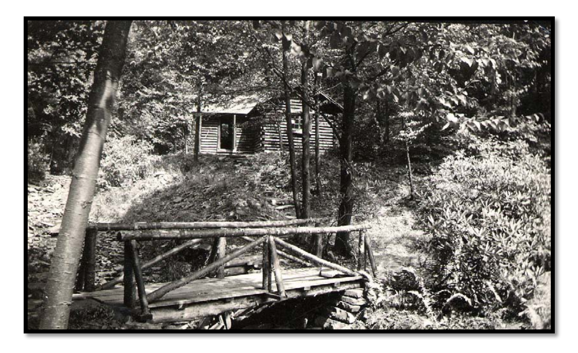
Figure 7. CCC cabin and bridge at Big Run State Park in Savage River, undated.