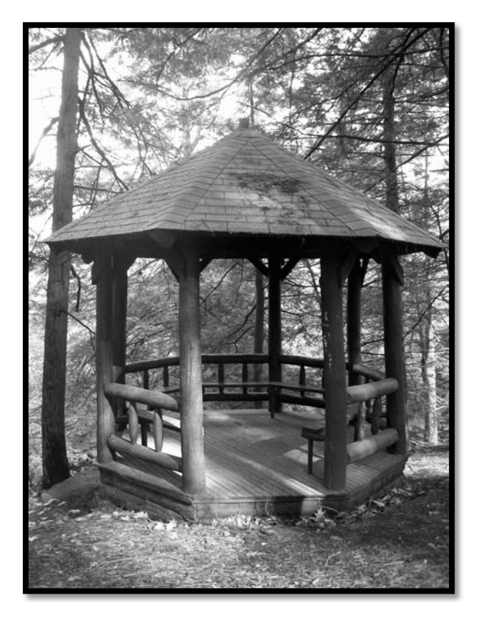
Figure 8. Gazebo at New Germany State Park. Photo by author, June 2010.