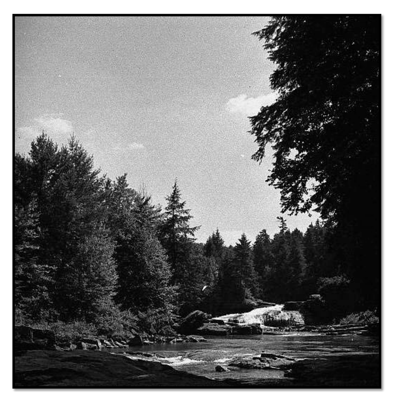
Figure 9. Swallow Falls, undated.