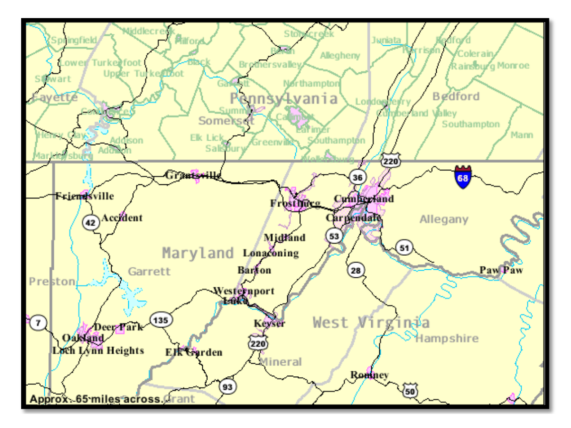
Figure 1. Map of Western Maryland and its borders. US Census Bureau, 2000 Population Statistics.