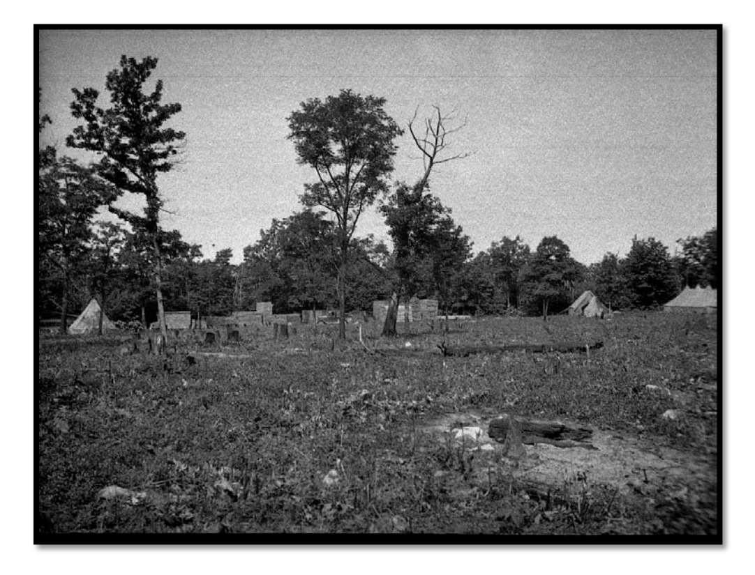
Figure 6. Camp S-61 Little Orleans Camp at establishment, July 1935. Courtesy of Maryland Department of Natural Resources.

Figure 5. Characteristic Topography, Garrett County, MD. Taken September 1935 by Theodor Jung . FSA LC-USF33-004022-M4. Farm Security Administration Photograph Collection, American Memory Project.