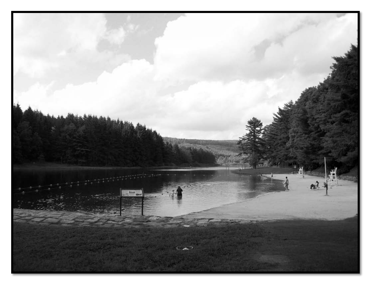
Figure 10. New Germany Lake. Photo by author, June 2010.