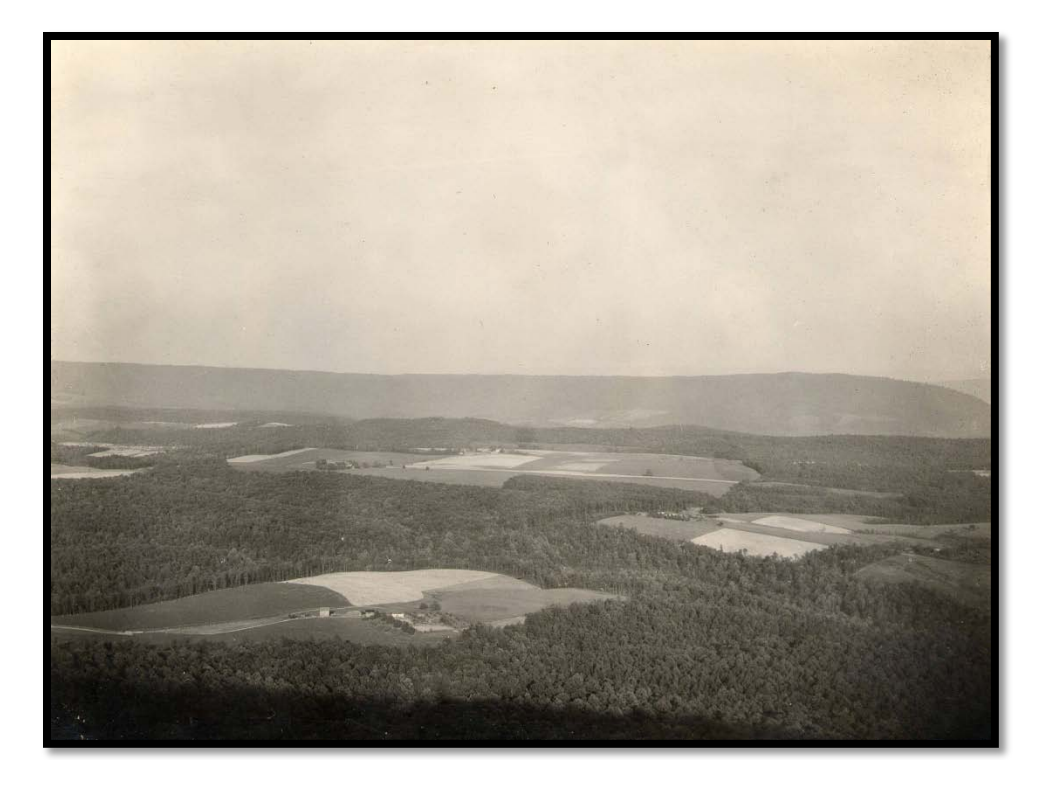
Figure 2. View from Fire Tower Hill, taken by Fred Besley in May 1932. Courtesy of Maryland Department of Natural Resources.