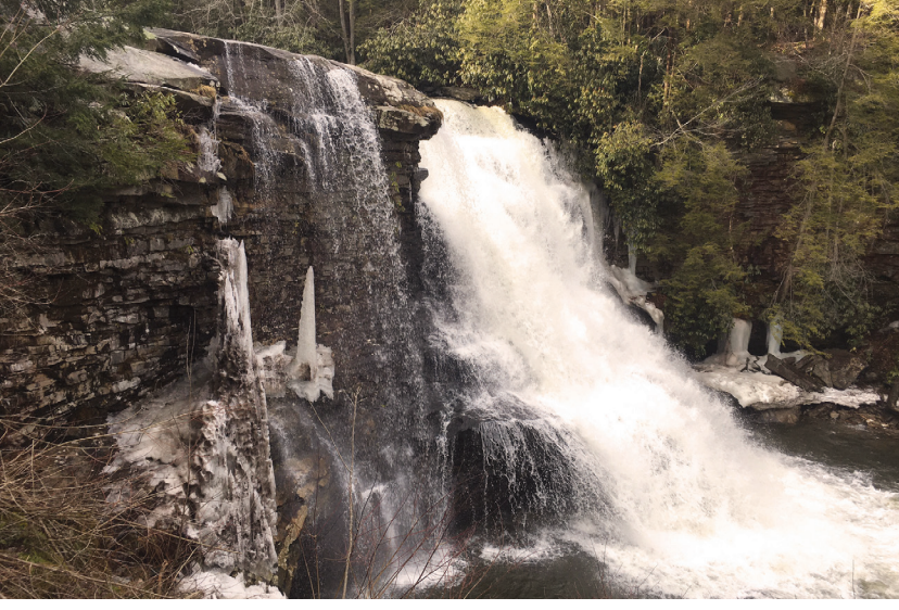
The view today of Muddy Creek Falls where the Vagabonds spent several days camping during their 1921 expedition.

The company offices of Ford and Firestone had been inquiring with some urgency when the two would return. With pressing business at home, the decision was made to spend only one night at Camp Cheat. The party left on the morning of August 2 to begin the return trip. After traveling through Fairmont, West Virginia, they stopped for a roadside lunch. Due to rain in Wheeling, West Virginia, the expedition modified their route and proceeded through Morgantown to the Summit Inn