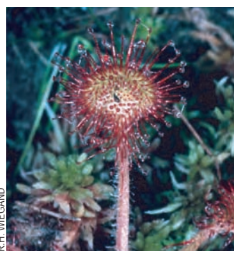
Carnivorous, invertebrate-eating plants like the northern pitcher-plant (Sarracenia purpurea, left) and the round-leaved sundew (Drosera rotundifolia, right) survive the acidic, nutrient-poor peat soils at Cranesville Swamp by capturing their own fertilizer.