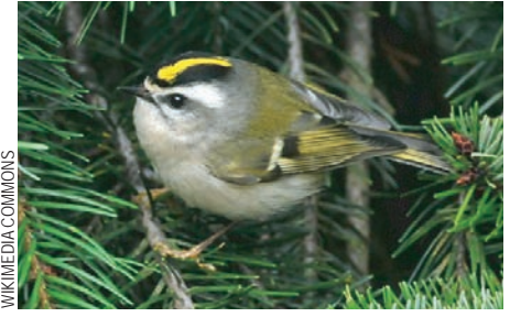
Look for tiny golden-crowned kinglets as they actively forage for insects and spiders among the branches.

about the branches. The trail through the forest leads to a boardwalk that takes visitors through the swamp where Endangered bog copper butterflies (Lycaena epixanthe) rest on the shrubs of Threatened small cranberry (Vaccinium oxycoccos). This protected area is one of the few boreal bogs still remaining in the southern United States and was one of the first National Natural Landmarks to be designated by the National Park Service in 1965. Cranesville Swamp is owned and managed by The Nature Conservancy.