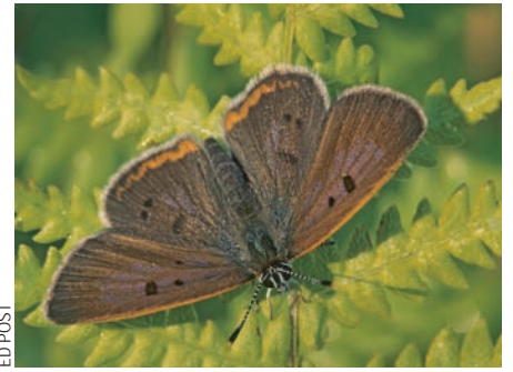
Bog copper adults feed almost entirely on the nectar of their larval host plant, small cranberry.

Deep within the bog, small pockets of virgin forest remain, somehow missed by the logging locomotive named the Swamp Angel that passed directly through the wetland in the late 1800s. Red spruce and white pine trees have been restored by the thousands and the Natural Area now supports thriving populations of wildlife such as American beavers, bobcats and American black bears. Rare species also abound, including the Endangered southern water shrew (Sorex palustris punctulatus), several birds such as the diminutive northern saw-whet owl (Aegolius acadicus) and the increasingly rare Nashville warbler (Vermivora ruficapilla), as well as many dragonflies, damselflies and butterflies. Rare plants like the Endangered American larch (Larix laricina), a conifer that loses its needles in the winter, can be observed near the boardwalk. Other rarities are hidden away deep in the bog, like the Endangered creeping snowberry (Gaultheria hispidula).