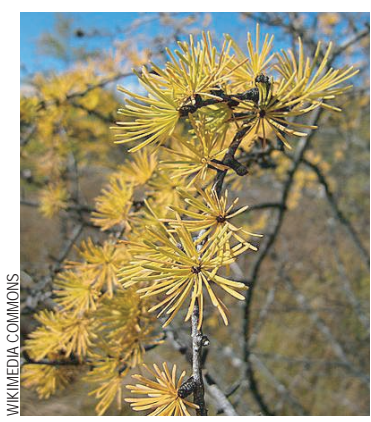
American larch needles turn bright yellow in the fall prior to being shed in the winter.