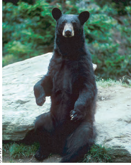
The charismatic American black bear is Maryland's largest mammal and is mostly vegetarian. Berries, acorns, and grasses make up much of its diet. It prefers large expansive forests away from human disturbance.