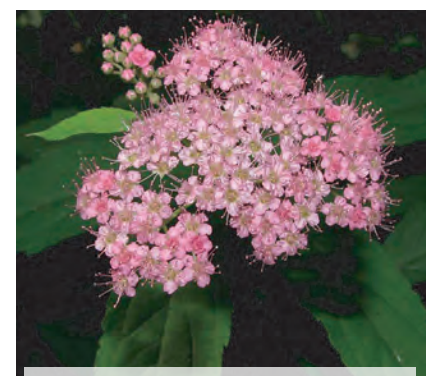
Japanese spiraea is an aggressive deciduous shrub that can rapidly crowd out native vegetation.

Within the older, intact sections of Bear Pen Run, visitors might be lucky enough to catch a glimpse of the elusive fisher. Fishers are medium-sized members of the weasel family, and are one of the few critters bold enough to take on the North American porcupine. Fishers will quickly flip over the quilled animal to get at its unprotected underside. Despite their name, fishers do not eat fish, but they do eat a variety of other mammals such as rabbits and rodents. On rare occasions they will also eat fruits and mushrooms, usually when no other food source is available. These agile hunters are seldom seen, due to their nocturnal and solitary nature.