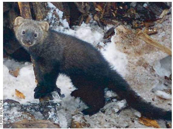
Although fishers spend most of their time on the ground, they are excellent climbers and will often hunt in trees.

One threat to leatherwood hu and the forest within Bear Pen Run is the prevalence of the invasive Japanese spiraea. This low-growing, clump-forming shrub rapidly forms dense stands, pushing out native species. Dedicated volunteer groups such as the Savage River Watershed Association annually pull this pesky plant in hopes of eradicating it from the area.