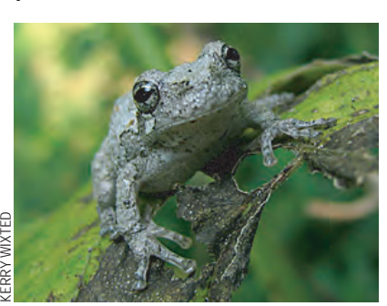
Gray treefrogs are superb climbers. Their color can change from gray to green or brown, depending on their environment or activity.