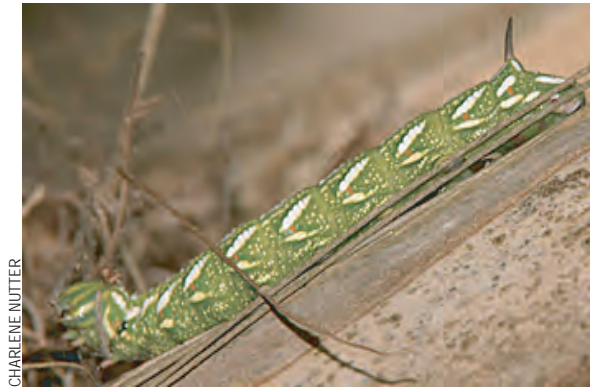
The colorful caterpillars of the highly rare cypress sphinx moth feed chiefly on bald cypress trees. After several molts, the larvae dig shallow burrows from which they will later emerge as adults.