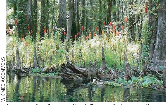
Above and Left: Cardinal-flower brings a vibrant splash of color to the swamp in summer.