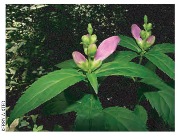
Red turtlehead is so named because its flower resembles a turtle's head. The plant's genus name ( Chelone ) is Greek for tortoise.