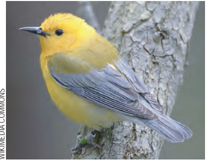
Listen for the cheerful "sweet" song of the male Prothonotary warbler in spring. The birds were named after the Roman Catholic Prothonotary clerks, whose robes were a bright yellow.

Battle Creek Cypress Swamp encompasses about 100 acres of cypress swamp and surrounding upland woods. It was purchased in 1977 by The Nature Conservancy and is currently leased and operated by Calvert County Parks and Recreation. The special habitat at Battle Creek was recognized as a National Natural Landmark in 1965.