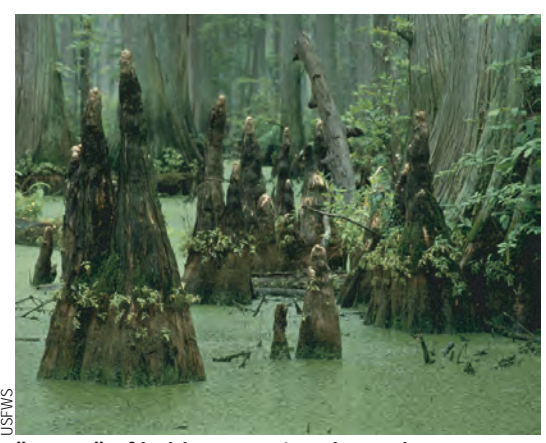
"Knees" of bald cypress jut above the water.

Bald cypress is typically a sub-tropical tree of blackwater swamps and cypress domes in the southeast. Prior to the last Ice Age, when mammoths roamed the State, bald cypress was more widely distributed. An ancient bald cypress trunk was unearthed during construction of the M & T Stadium in Baltimore. Scientists believe that as the climate