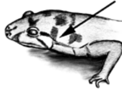
No external gills