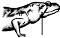
Pale diagonal lines from eye to angle of jaw - Rear legs conspicuously larger than front legs