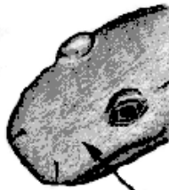
Canthus rostralis absent