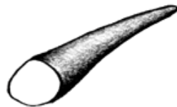
Tail rounded or oval