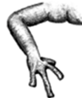
Didgits square-tipped and expanded