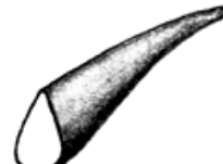
Keel present on posterior half of tail