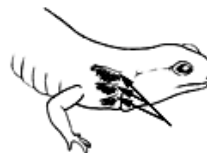
Gills with rachises