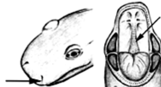
Nasolabial grooves; Long tooth patch