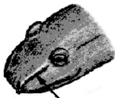
Canthus rostralis present