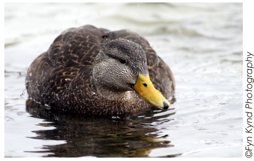
American black duck.

Both eastern Canada and eastern U.S. have seen the number of duck hunters decline since the 1980s, as well as the harvest of black ducks. Since the late 1990s, the combined black duck harvest in the two countries has