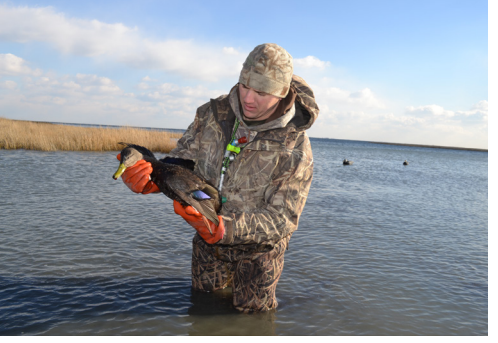
Black ducks are among the most prized species for duck hunters in the east.

These developments allowed U.S. and Canadian biologists to gain better insight into one of the most debated questions in waterfowl management over the past half century: "What effect does hunting have on the population?" If annual survival rates are lower in years when harvest rates are high, and increase when harvest rates decline, then this would suggest that harvest has a negative effect on annual survival and to some extent