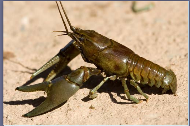
MDNR banned the use and possession of live crayfishes in Lower Susquehanna, Middle Potomac, and Upper Potomac river basins to prevent the transport and introduction of this and other invasive species into other Maryland watersheds.

Once an invasive crayfish is introduced into a stream or lake, it is impossible to eradicate it without harm to native crayfishes and other non-target species. Since eradication is impossible without harming other species, preventing introductions is the only effective way to halt the spread of invasive crayfishes.