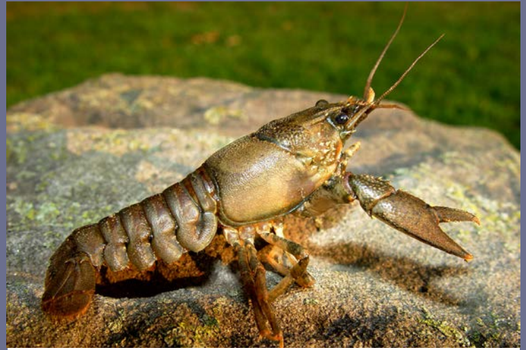
Spinycheek Crayfish is a native species that has dramatically declined as the invasive Virile Crayfish has spread in Central Maryland.

The most obvious impact of non-native, invasive crayfishes in Maryland has been concomitant declines in native crayfish species. Non-native, invasive crayfishes tend to quickly colonize a new area and become very abundant. These species are aggressive and efficient at competing with and displacing native crayfishes. The ranges of two natives, the Spinycheek Crayfish ( O. limosus ) and Allegheny Crayfish ( O. obscurus ), dramatically declined as the invasive Virile Crayfish spread over the past 50 years. The Spinycheek Crayfish is now extirpated from several watersheds in Central Maryland where it was once common.