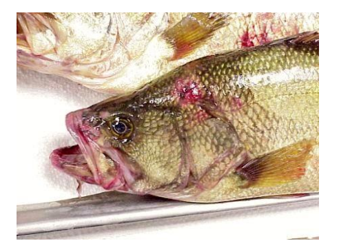
Largemouth bass virus