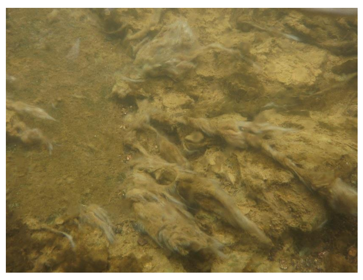
Didymo in the Gunpowder River