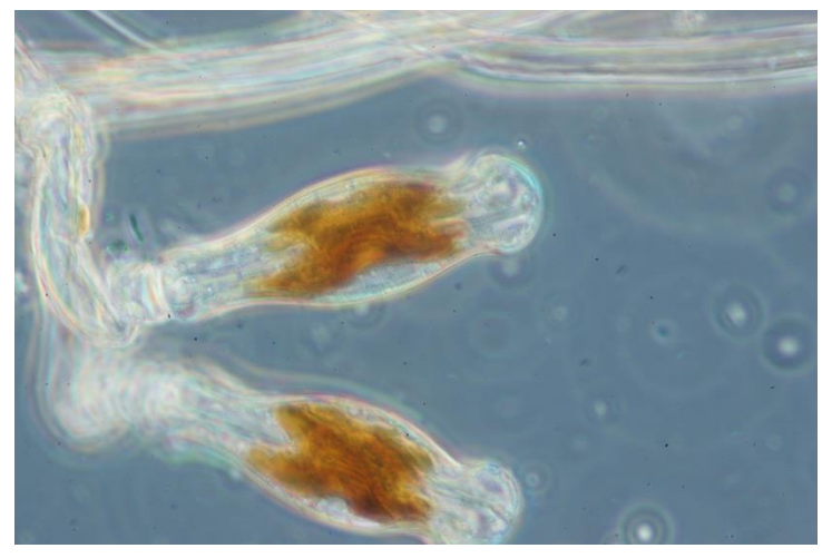
Microscopic image of didymo cells