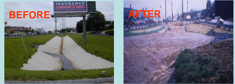
Longwell Branch, in Carroll County before and after a rain storm.

Impervious surfaces prevent rain water from soaking into the ground, filtering through soils, and slowly seeping into streams. Instead, the rain water accumulates and flows rapidly into storm drains. Impervious land cover is harmful to streams in three important ways: