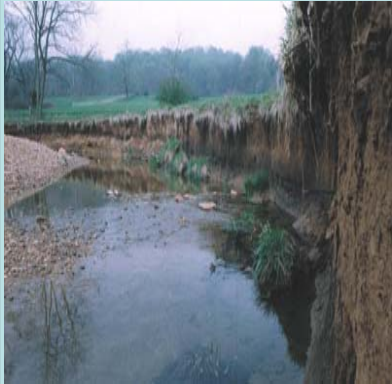
Severe stream bank erosion in Minebank Run, Baltimore County .

During warm weather, rain that falls on warm pavement becomes superheated. Hot water flows directly to streams via storm drains and can be stressful or even fatal to stream inhabitants.