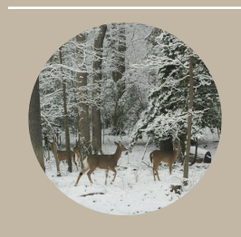
Calendar of Events Join us for a variety of fun, family-oriented programs!