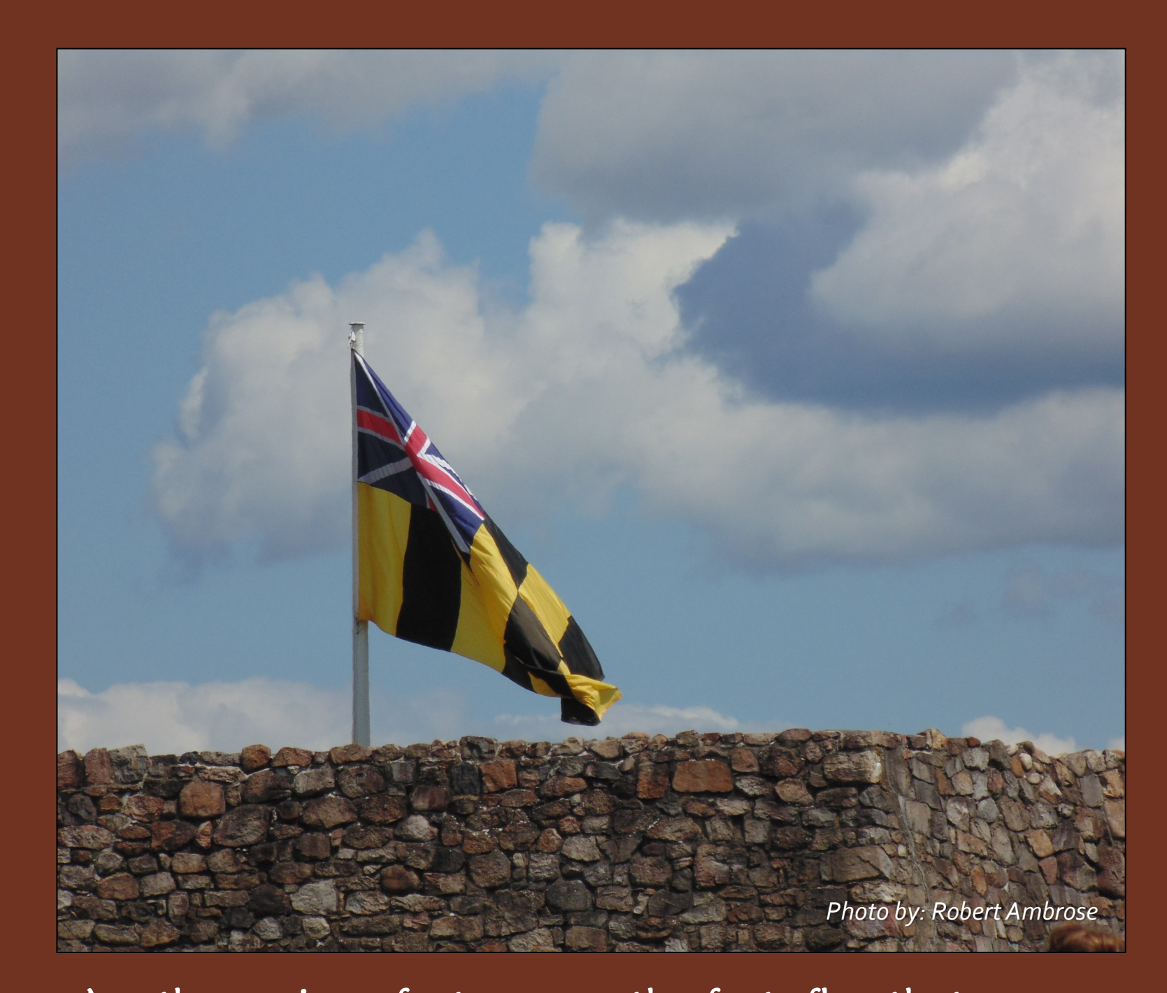
Another unique feature was the forts flag that Governor Sharpe ordered for the fort to be, "a Black & Yellow Flagg 24 feet long and 16 feet broad with the Union in One Corner". This flag is not known to have been flown anywhere else.

During the French and Indian War the fort would never be directly attacked but served as safe place for the Maryland soldiers to reside between patrols, as well as a major supply base during the Forbe's Campaign to 1758.