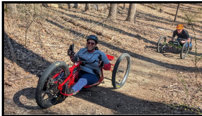
Riders on adaptive e-bikes

Adaptive e-bikes are permitted on any state lands and trails where Class 1 e-bikes are permitted.