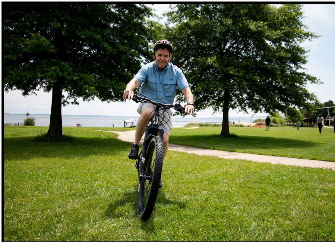
Rider on e-bike.