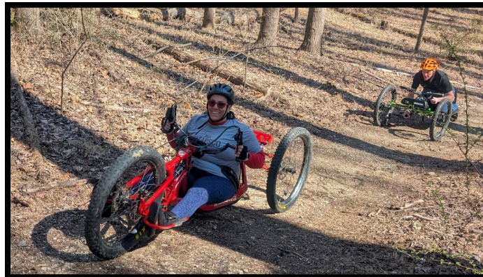
Riders on adaptive eBikes

An adaptive bike is a bicycle with a specially made mobility device for individuals with physical disabilities or mobility challenges. It can be customized with hand cycles, three wheels, adaptive seating, and more. Adaptive eBikes are permitted on any state lands and trails where Class 1 eBikes are permitted.