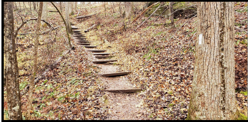
Trail at Patapsco Valley State Park, McKeldin Area