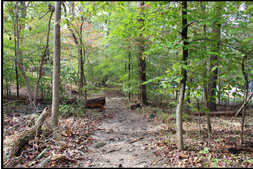
Natural surface trail at Patapsco Valley State Park, Hilton Area, by Karin Dodge.