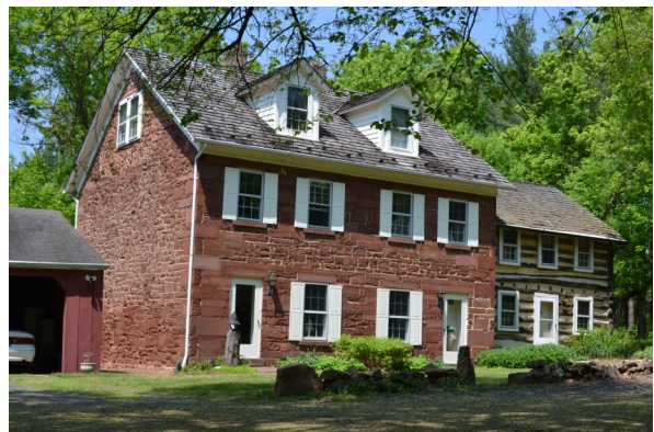
Quarry Master's House before and after.