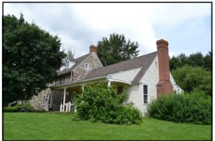
Gittings-Baldwin House Gunpowder Falls State Park