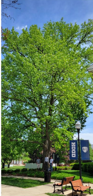
Hood College Sweetgum