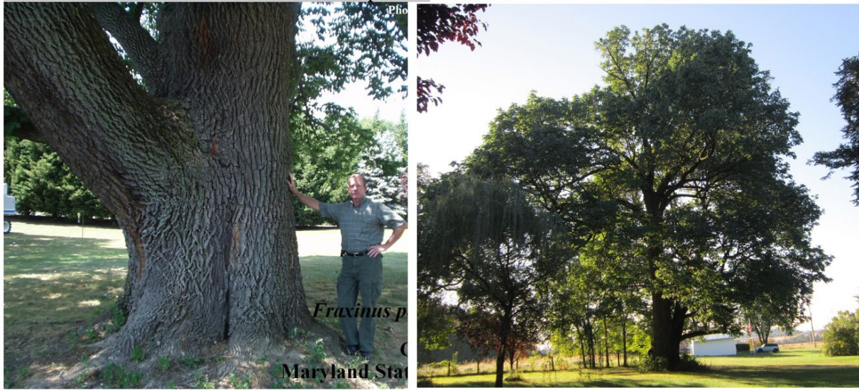
Figure 1. Trees referenced in the MD Big Tree Program Report.