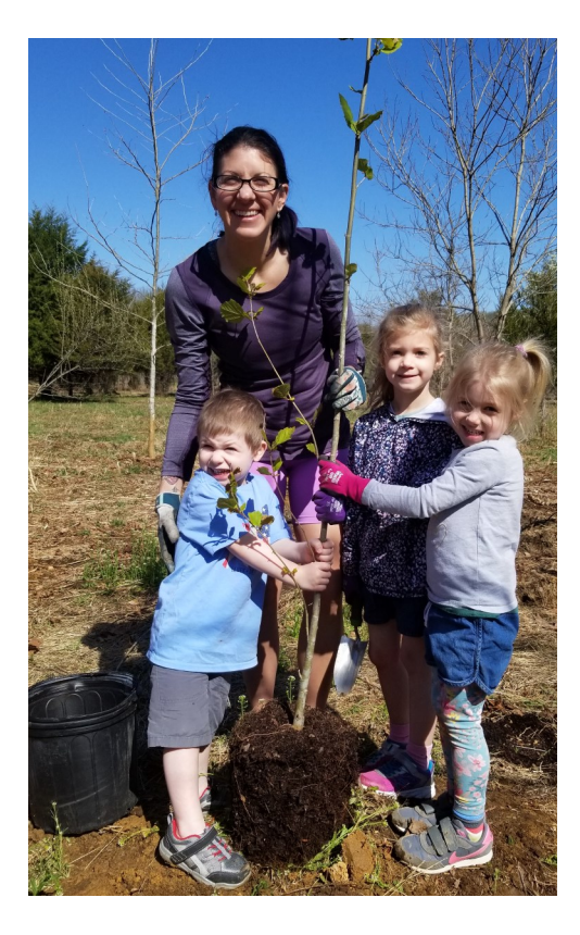
Above: Mom and kids showing off their tree at Harford County's 2022 Arbor Day volunteer planting event and the Harford County Landfill.