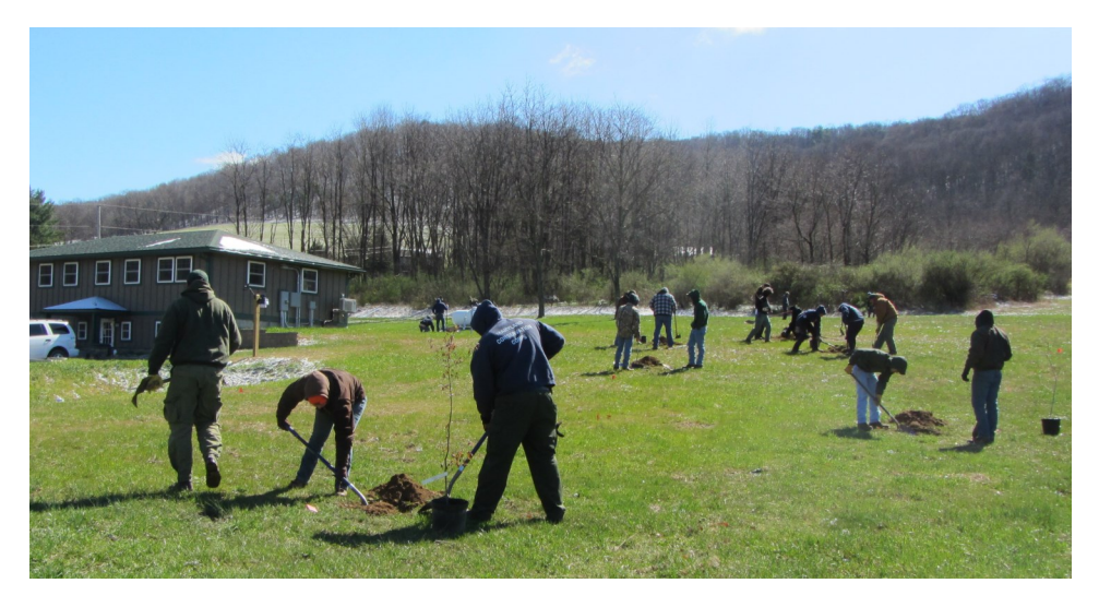
BEFORE: Maryland Forest Service staff and students from Allegany College of Maryland planting trees in 2016.