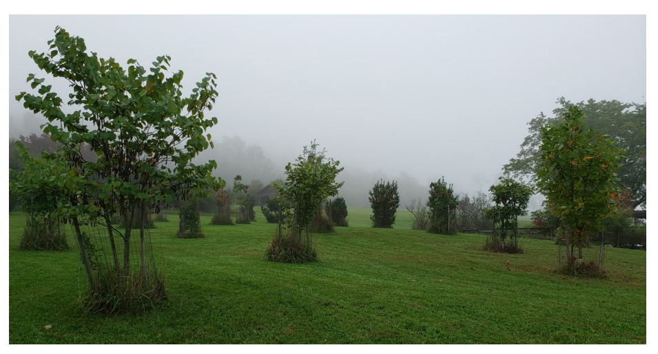
AFTER: Diverse tree selection five years after planting (2021). Maryland Forest Service's Western Regional Office in Flintstone, MD.

For a Recommended Tree List of native species and a coupon visit and click on "Plant Trees" at the bottom of the page: https://dnr.maryland.gov/ forests/Pages/default.aspx