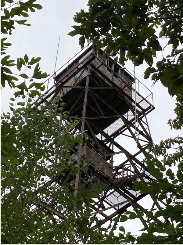
A. Black Hill Fire Tower, Elk Neck State Forest Cecil County, Maryland