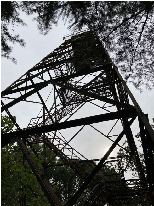
B. Long Hill Fire Tower, Pasadena Anne Arundel County, Maryland