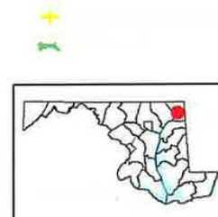
B. Long Hill Fire Tower, Pasadena Anne Arundel County, Maryland