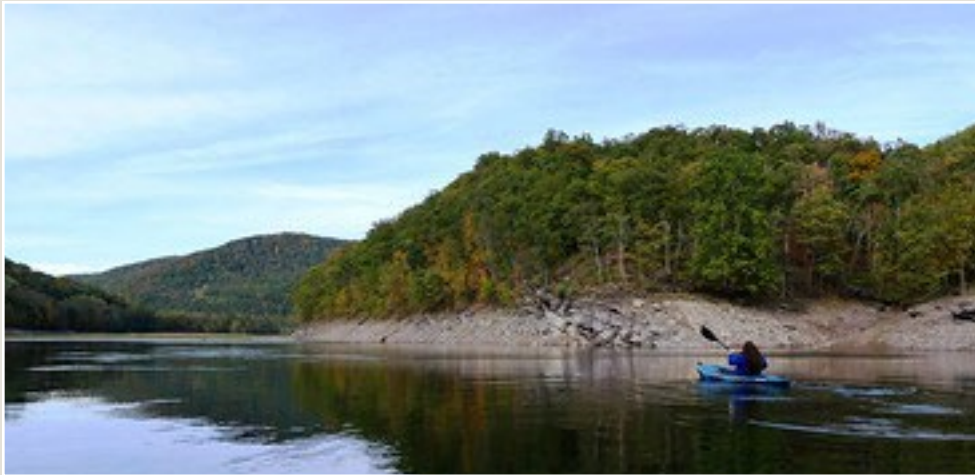
Savage River State Forest