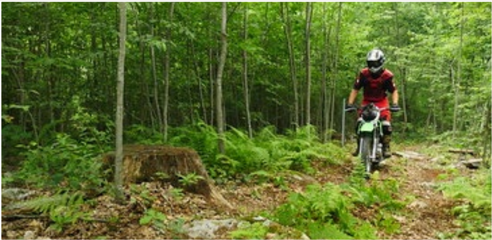
Savage River State Forest, Photo taken by: Stephen Badger