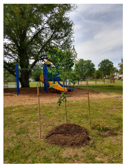
Tree planted in a Calvert County Park

Always know what your tree will look like when it is mature. How tall and wide will it grow? Is enough space available for the tree when it grows up. Will it be too close to my house or driveway? Will it grow over onto my neighbor's property? Will it grow into a power line? Remember: Look up, down and all around to check the planting site.