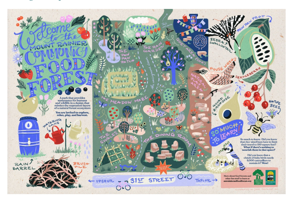
{\it 2020 Food Forest Project in Prince George's County partially funded by MUCFC.}

https://dnr.maryland.gov/forests/Pages/programs/urban/mucfcgrant.aspx