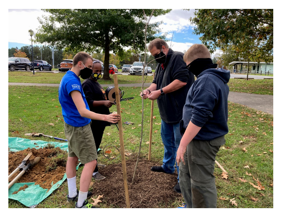
Youth assisting with guywire at St. Mary's County public park planting event.