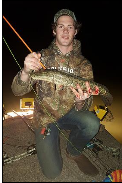
(L to R) Northern snakehead caught in the C&O Canal near Violettes Lock; northern snakehead shot bowfishing in mainstem upper Potomac River in spring 2016

MD DNR strongly encourages anglers to harvest and kill any northern snakehead that they catch. It is against Maryland, Virginia, and federal laws to possess, import, or transport live northern snakehead. Maximum penalties are 5 years in prison and fines up to $250,000. If you do want to keep a northern snakehead, you must kill the fish by removing its head, gutting it, or removing its gill arches. There is no minimum size or creel limit. If you do catch a northern snakehead in the upper Potomac River, please report your catch to MD DNR by email ( fishingreport.dnr@maryland.gov ) or phone (410-260-8300).