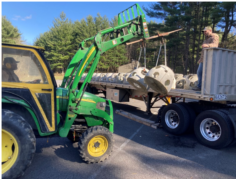
Offloading the reef balls

Fish habitat enhancement projects are underway in three state owned lakes located in western Maryland. Fishing and Boating Service's Freshwater Fisheries Program secured grant funding from the "State Lakes Protection and Restoration Fund" ( https://dnr.maryland.gov/Pages/state-lakes.aspx ) to purchase and deploy 150 concrete reef balls to enhance fish habitat in Lake Habeeb, Hunting Creek Lake, and Blairs Valley Lake. Last week, the first 50 reef balls were delivered to Rocky Gap State Park and deployed in Lake Habeeb. The structures were placed in seven popular fishing locations around the lake. The project used "mini-bay" reef balls that are approximately two times the size of a normal bushel basket and weigh approximately 300 pounds each. The structures were maneuvered and loaded using heavy equipment operated by Rocky Gap State Park staff. The structures were deployed using a buoy-tending boat captained by Hydrographic Operations staff within Fishing and Boating Services. Many thanks to the staff of Rocky Gap State Park and Hydrographic Operations for their cooperation and assistance with the project. It could not have been completed without their help.