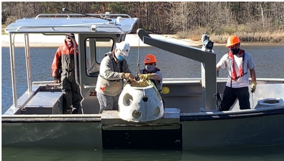
Reef ball deployment