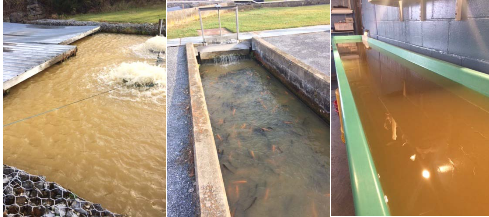
Photos from December 2, 2016 silt event at Albert Powell Hatchery.

Fishing and Boating Services staff is working with Maryland Department of Environment, Maryland Geological Survey, and the Washington County Health Department to determine potential causes for the silt events and develop possible solutions. The Department of Natural Resources has temporarily deployed a seismometer to determine activity underground that may be impacting the hatchery's spring.