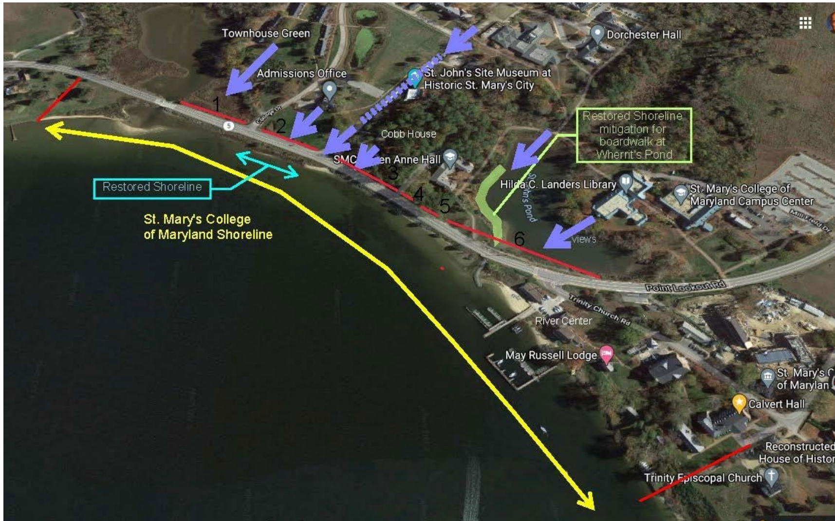
Map 1. Buffer Use Areas