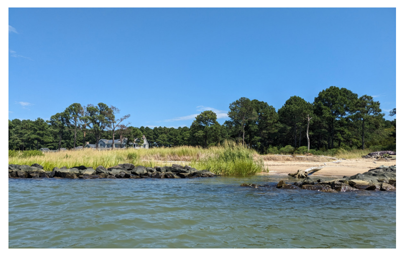
Koontz, E. (2023). A living shoreline grows along a waterfront beach in Maryland.