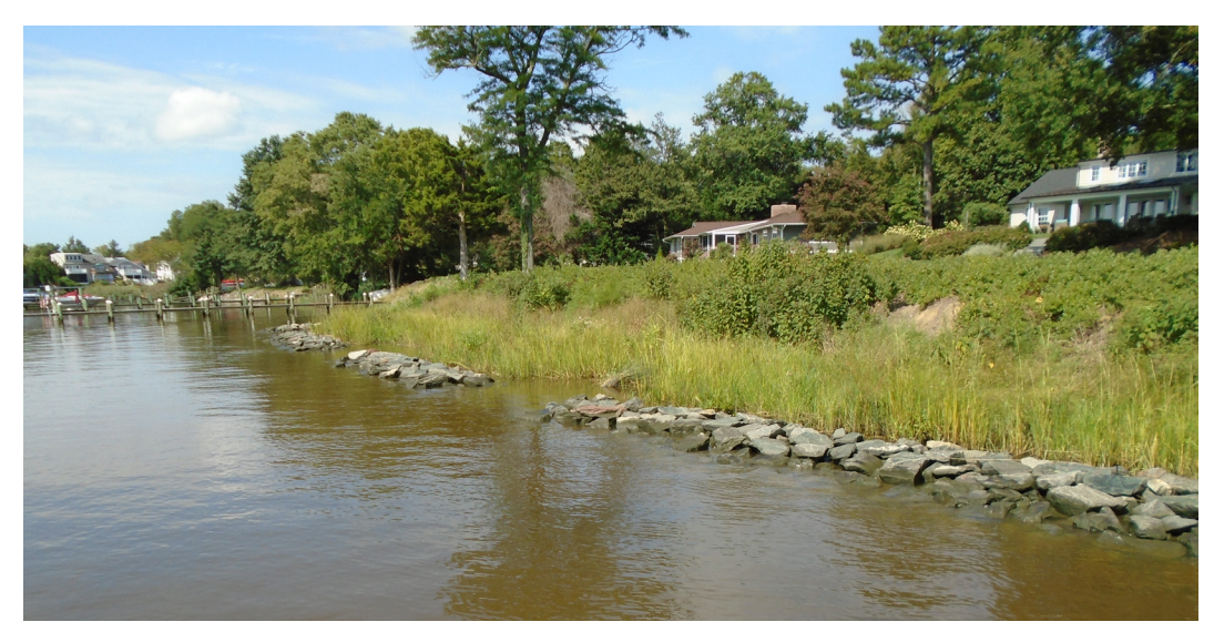
Buehl, E. (2020). Living Shoreline on the Chester River near Chestertown, Kent County, MD.

This guide provides an overview of Maryland's laws governing living shorelines, which provide crucial ecosystem services, including shoreline stabilization, flood control, nutrient filtration, and wildlife habitat. This document also includes a step-by-step guide for waterfront property users on how to apply for a license or permit with State and federal agencies to place a living shoreline on one's property.