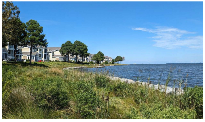
Koontz, E. (2023). A segmented sill living shoreline site on Kent Island, MD.

Evaluation Criteria for a Wetlands License or Permit can be found at COMAR 26.24.02.02 (1-19).