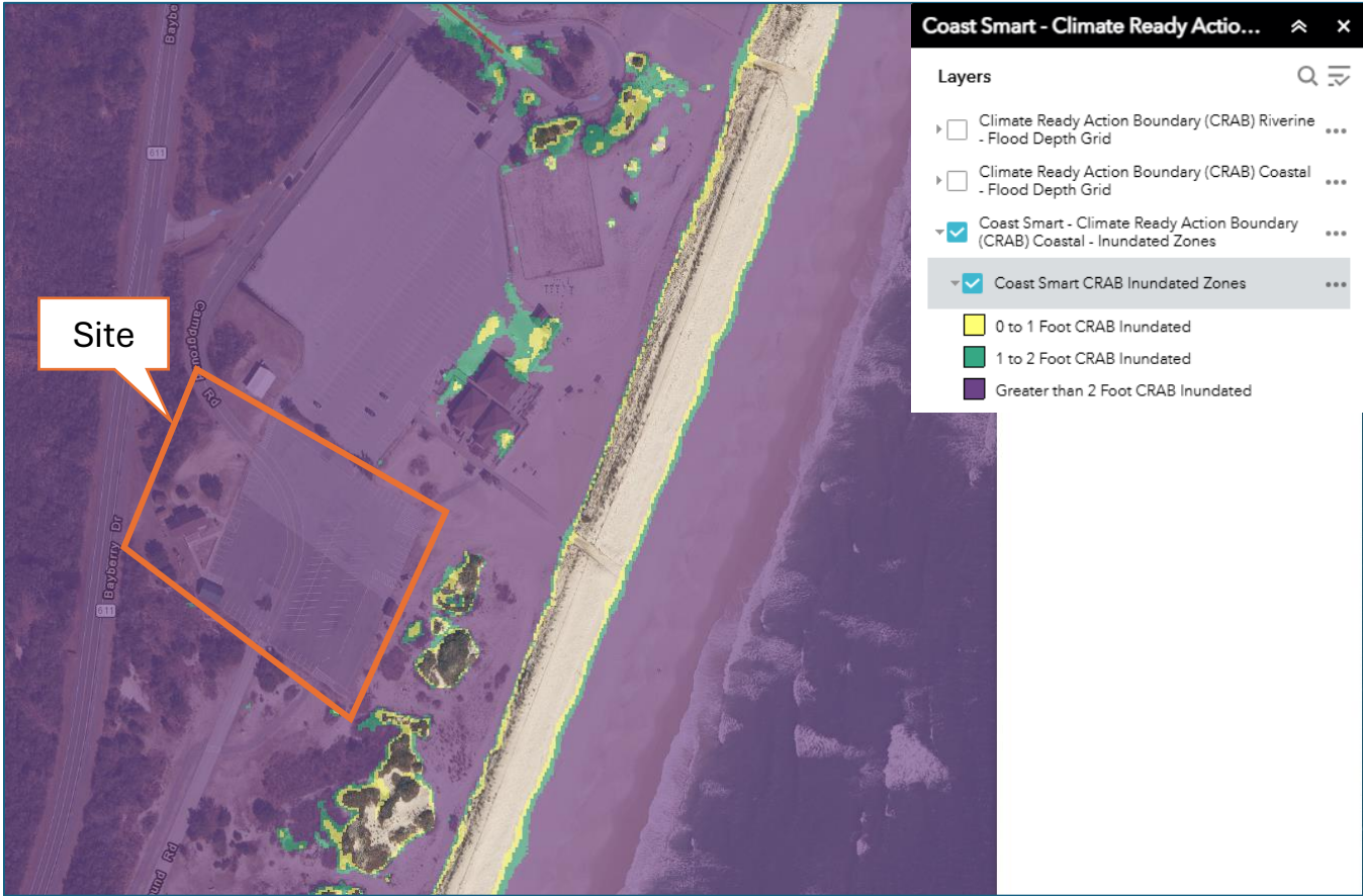
CS-CRAB (Coast Smart – Climate Ready Action Boundary)