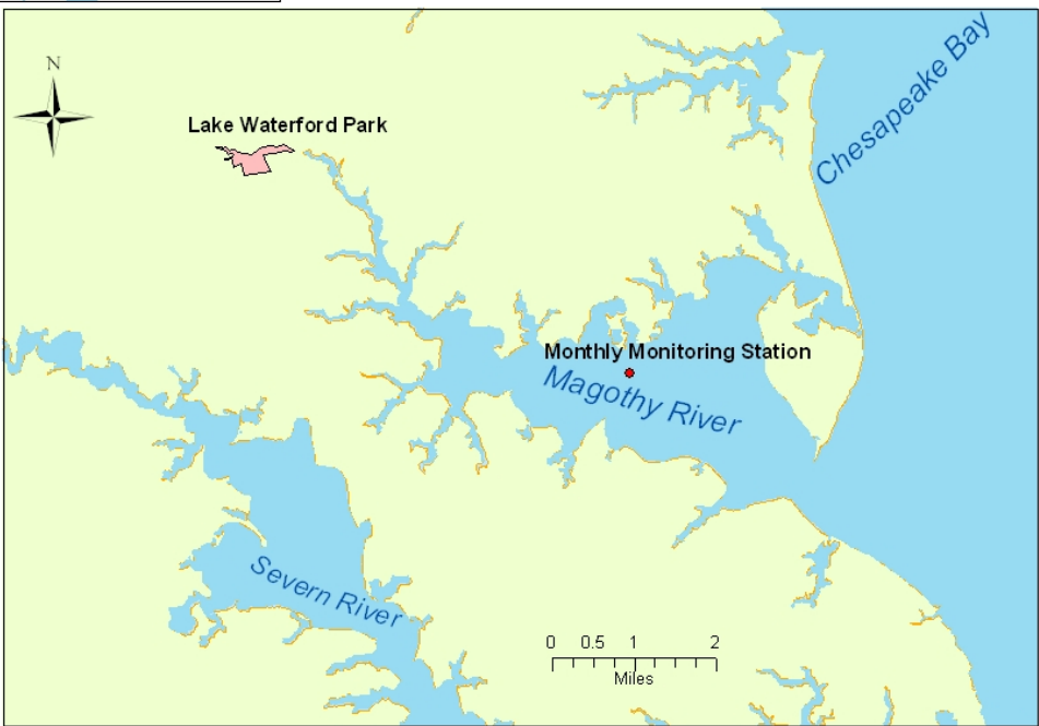
Figure 1. Map of the Magothy River showing Lake Waterford Park and Maryland DNR's Fixed Monthly Monitoring Station.

Water Quality data collected two days later on March 25<sup>th</sup> at Maryland DNR's Fixed Monthly Monitoring Station downstream from Lake Waterford on the Magothy (see Figure 1) showed that dissolved oxygen levels in the river remained severely low at 0.80 mg/l (Figure 2).